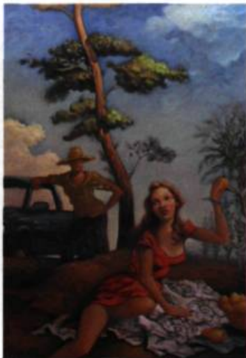
Lemon Tree , 2008 Oil on canvas 62 x 84 in.

The historical and literary references are this time secondary to the strange drama taking place in McCall's canvases. In Your Friend Little Bear , Tyrolean trekkers converse beside an enormous fallen tree stump that seems to be morphing into a soft bulbous matter, a red snowplough idles in a garage behind