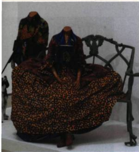
Yinka Shonibare Mr. and Mrs. Andrews without their Heads , 1998 Wax-print cotton costumes on mannequins, dog mannequin, painted metal bench, rifle Collection of the National Gallery of Canada Purchased 1999 39849.1-5

General Idea collective (1965-1995) becomes AIDS (1989) wallpaper, not the subject but a background. A Black Like Me movie poster, the film about white Texan journalist John Howard Griffin's 1961 real life account of the bad treatment he received when disguised as, and perceived as a black in American society hangs on that AIDS wallpapered wall. Cartoonist Art Spiegelman's In the Shadow of No Towers , is part auto-bio with the artist as a cartoon figure furious about America's involvement in the Iraq war. Other scenes above depict George W. Bush as a troll/cowboy with pro-war demonstrators.