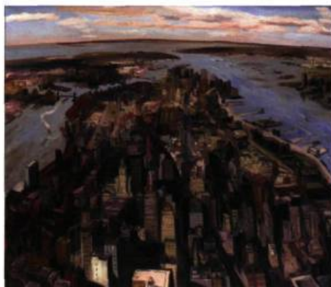
Lower Manhattan, 2006 Oil on linen 198 x 229 cm

Kenderdine Art Gallery 51 Campus Drive, University of Saskatchewan, Saskatoon, Saskatchewan S7N 5A8 Telephone: 306-966-4571 April 4 to June 27, 2008