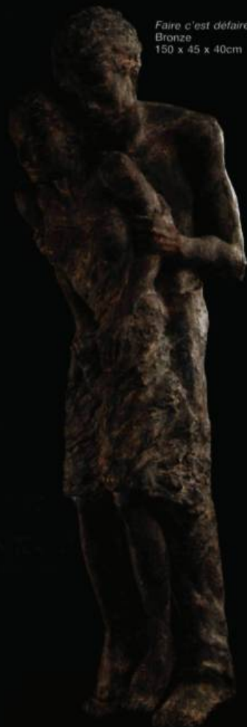
Faire c'est défaire , (2007) Bronze 150 x 45 x 40cm