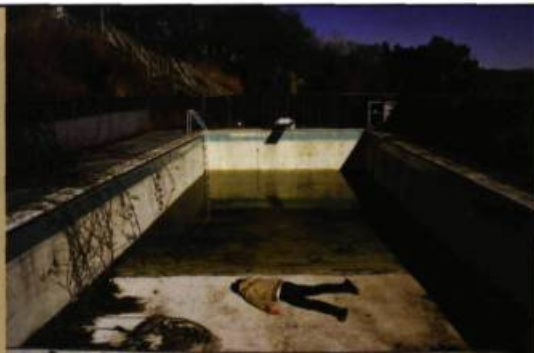
Over My Dead Body (in pool), 2008 35 mm colour print on photographic paper 16 x 22 in.

These simultaneously prescient and speculative photographs of Speller's end will prompt viewers to participate in the artist's art-making as an act of resistance. Like both the guardian angel and the angel of death, the viewer watches over Speller as he works in the gallery, just