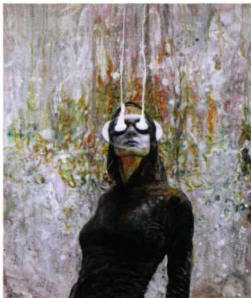
Engulfed, 2007 Oil and acrylic on canvas

The painterly aspect of his works is particularly intriguing and hints at the artist's yearning for abstract expression. This "desire to paint" manifests itself in the colourful magma oozing, spilling into otherwise realistic scenery; in the bright pop-art specks that litter the steps of an escalator; in the grotesque, Baconish figure suspended against a giant industrial crane.