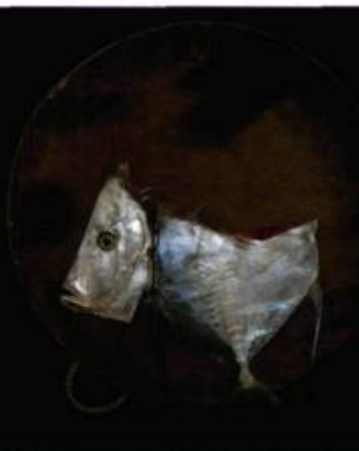
I remember and I forget, 2007 50 x 50 cm on 60 x 60 cm paper