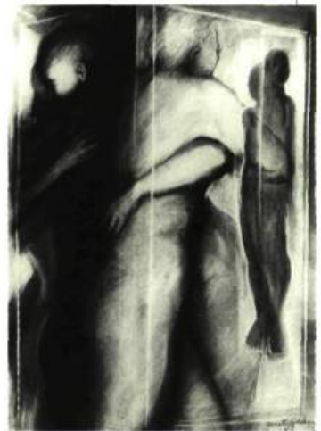
Dorothy Grostern Charcoal on paper