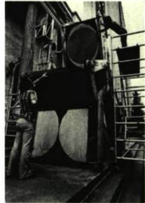
1. Guy MONTPETIT Sculpture dans Corridart, 1976.

En 1972, Montpetit dresse, dans le hall ouest du nouvel édifice montréalais de Radio-Canada, une importante murale en relief, employant tout le budget accordé à la fabrication matérielle et à l'installation