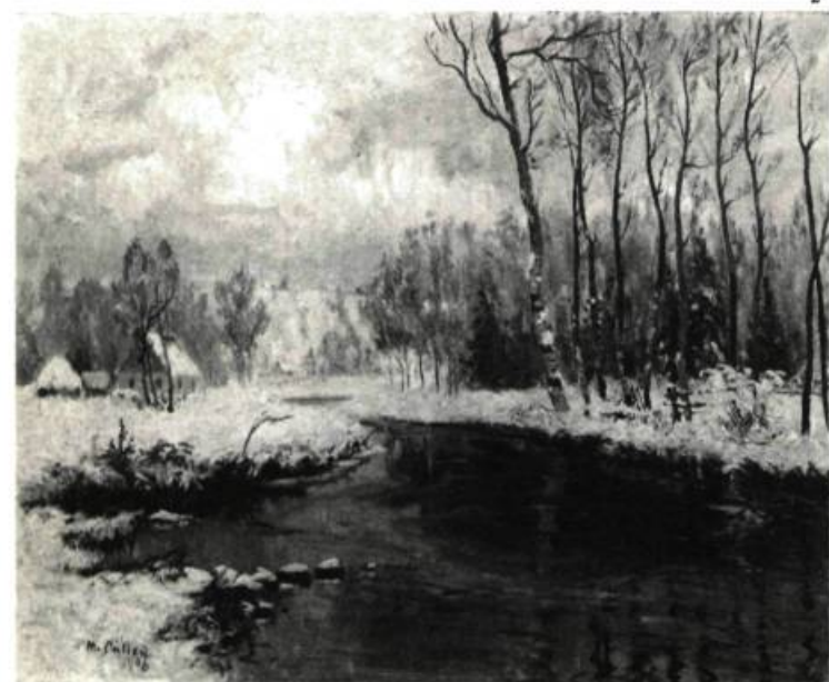
1. The Old Ferry, Louise Basin, Quebec . Oil on canvas. 23 ins. \frac{3}{4} by 28 \frac{3}{4} (60,35 x 73,05 cm).

In contrast, Cullen was pursuing a goal of visual truth to nature. While painting the Canadian countryside, he was aware that the quality of light, colour and space was different from that found in France. He saw that a typical winter's day was characterized by the cool crisp atmosphere, the vivid colours and the feeling of clearly defined space. By accurately portraying these features Cullen broke with European tradition and produced the first distinctively Canadian landscapes.