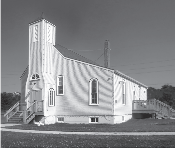
Figure 5. Rebuilt Africville Church.

of government. 146 In 2012 work finished on the rebuilt Africville Church and Museum, and the community celebrated its lost settlement (figure 5). 147