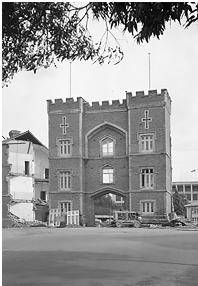
Figure 3. The Barracks Archway with one wing gone and the other partially demolished, 10 June 1966. Photograph by Ken Hotchkinn. Courtesy State Library of Western Australia, 280156PD

Concern about the route of the western leg of the freeway had surfaced a decade earlier when it became clear that a deep cutting would slash through existing streets and destroy the historic Barracks (figure 3). The Barracks, built in 1866, accommodated the British Pensioner Guards who accompanied convicts to Western Australia. The building had been used for government offices since the late 1890s, with inexpensive temporary