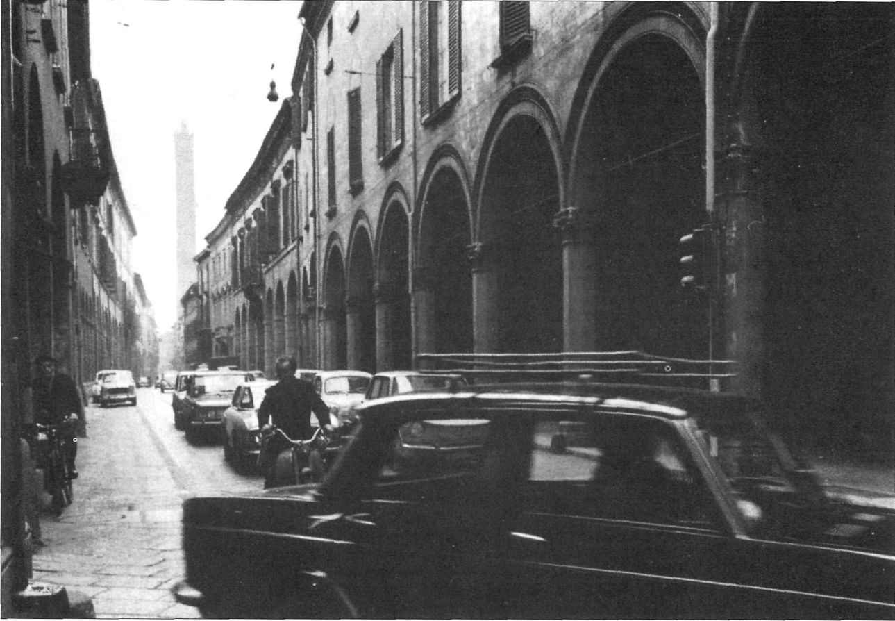
Figure 4: Paolo Monti, photograph of Strada Maggiore with traffic. From Bologna centro storico , 193.

such as pictorial traditions, literary descriptions of the city, local histories, urban biographies. 46 The complexity of this visual and textual stratification is particularly evident in the short films that Renzo Renzi made in the 1950s for the Provincial Tourist Office. His Guida per camminare all'ombra ("A Guide to Walking in the Shade," 1955), written with Leone Pancaldi, reconstructed the history of Bologna's arcades and portrayed them as the key element of the image of the city. Arcades contributed to the character of an urban scenery that was, as the script went, "perhaps without big architectural individualities but bound together and homogeneous." 47 Bologna's arcades were also a key element of Monti's photographic survey and a recurring theme of the image of the city outlined by the 1970 exhibition. It is interesting to note, however, that no specific attention had been given to these defining elements of the cityscape in the plan of 1969.