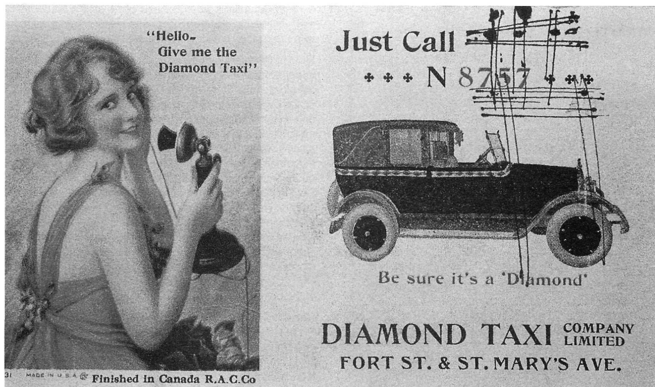
Figure 2: This 1920s advertising blotter for Winnipeg's Diamond Taxicab Company captures the industry's reliance then on purpose-built cabs and on a switchboard to attract business.

a private hotel or railway concession by parking nearby on the public streets. The budget-conscious would find them. While municipal governments tried to limit the number of these street stands in order to improve traffic circulation, regulations were not strictly enforced. Besides, cab companies were often allowed to park a vehicle on the street in front of their office or garage, and they took care to locate these near railway stations and the correspondence points in the tramway network. As municipalities rarely, if ever before the Second World War, charged rent for these street stands, it was possible for the owners of a single cab to scratch out a living by operating from one. 12