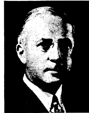
The Honourable J. L. Ilsley, Minister of Finance (Canadian Business, 1944)