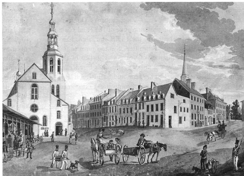
PICTURE 2: Robert Sproule. The Market Place, Upper Town, Quebec, 1830 . (McCord Museum, McGill University, Montreal. No. M384). Légaré appears to have based Cholera Plague, Quebec's streetscape on this marketplace watercolour by Sproule.

through investments in Quebec City real estate. (Légaré himself also earned income from property rental).