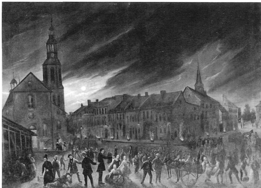
PICTURE 1: Joseph Légaré. Cholera Plague, Quebec, 1832 . (National Gallery of Canada, Ottawa. No. 7157).