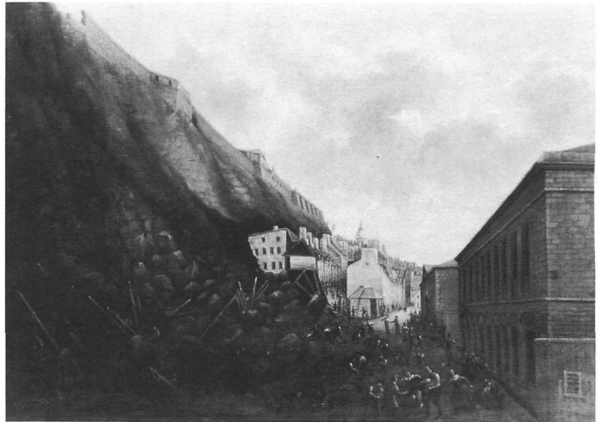
PICTURE 4: Joseph Légaré. Landslide At Cape Diamond (Eboulis du Cap Diamant) . 1841. (Musée du Séminaire de Québec, Québec. No. PC 983.30 R 243. Photographer: Pierre Soulard).