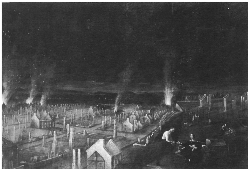
PICTURE 7: Joseph Légaré. L'incendie de quartier Saint-Roch vue de Côte-à-Coton vers l'est. (Musée du Séminaire de Québec, Québec. No. PC 984.6 R 239. Photographer: Pierre Souillard).

in the picture a small group of British soldiers stands idly by, doing nothing to help with rescue work. Soldiers occur, too, in one of Légaré's views of the Saint-Jean fire: an armed formation apparently present to maintain public order.