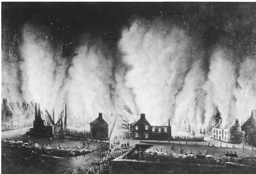
PICTURE 5: Joseph Légaré. L'incendie du quartier Saint-Jean vu vers l'ouest . (Art Gallery of Toronto.)

tent. 10 There also appears to be political meaning in some of his city painting.