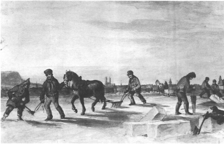
PICTURE 7: James Duncan. Ice Cutting on the St. Lawrence at Montreal . (Royal Ontario Museum, Toronto. Neg. -No. 73CAN362. Cat No. 950.66.1.) Cutting and hauling ice from the river was another common theme of 19th century artists.

Duncan's production of city art for the commercial market was varied, including depictions of various newsworthy incidents (the funeral of General D'Urbain, a fire which destroyed the Hayes mansion, the Gavazzi riot); picturesque watercolour cityscapes of Montreal from the mountain and river; portraits of stereotypical tuqued and pipe-smoking Canadiens in Bonsecours market (while Krieghoff's Quebecers were usually rural people, Duncan's were city-dwellers); and a view of middle class Montrealers — members of a local sleighing club — at play (among anglophone burghers and tourists, sleighing pictures were quite popular). The illustrations commissioned for Hochelaga Depicta , on the other hand, are precise architectural drawings of important local buildings (like Short's and Cockburn's work in Quebec, they are valuable historical documents 12 ).