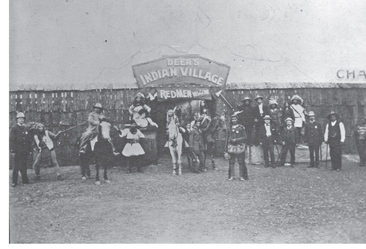
Fig. 2. Deer's Indian Village.

the specific processes, challenges, and opportunities that are bound up in her work as an author of material texts that live in the commercial sites of spectacle wherein contemporary Native experience is performed. [...] Together, we ruminated upon the Aboriginal theatre worker's struggle to address and resist being packaged as a spectacle for voyeuristic consumption while concurrently trying to attract audiences in to hear our stories. (6)