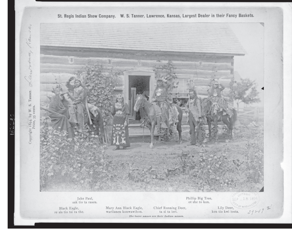
Fig. 1. W. S. Tanner, (Group portrait of St. Regis Mohawk men and women in costume outside log building, some on horseback) ca. 1894.

self-representation (Tanner holds copyright and sells the card for 35c).<sup>13</sup> As the Deers developed their travelling acts, they took this power of brokerage to themselves.