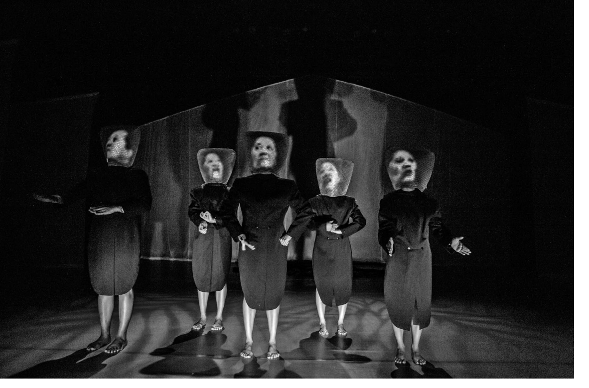
The five Maori performers of Mana Wahine, IMPACT '17 Festival, by Okareka Dance Company.