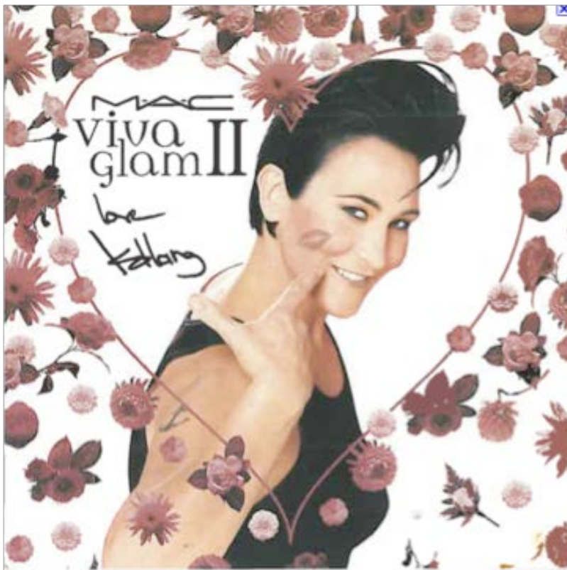
Figure 2: MAC Cosmetics VIVA GLAM II campaign featuring k.d. Lang, 1997.