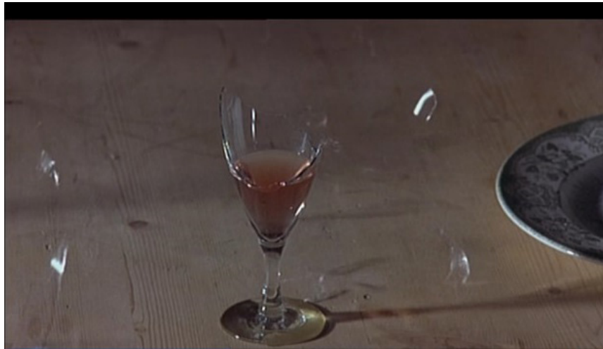
Figure 2: Shattering a glass with sound. The Shout (Jerzy Skolimowski, Recorded Picture Company, 1978).

Acoustic phenomena, such as glass shattering and doors slamming, are repeated (Figure 2). Sounds of insects buzzing and of the wind blowing recur. The Shout exploits the emerging sound technology of Dolby Stereo to craft the score and the shout. 3 When first released, it was an acoustic cinematic event, showcasing Dolby's capacity to reshape audience perceptions regarding the importance of film sound. Skolimowski has discussed the use of Dolby to create the yell, noting that the main sound was of "a man shouting like hell" but that this was one of 40 or more tracks that were combined to produce the intense vocalisation that is the shout. The other tracks included sounds such as "Niagara Falls, the launching of the Moon rocket, everything" (Strick 1978, p. 147).