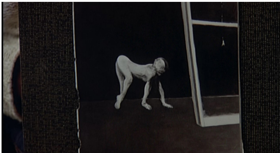
Figure 7: Francis Bacon, Paralytic Child Walking on All Fours (From Muybridge), 1961. The Shout (Jerzy Skolimowski, Recorded Picture Company, 1978).