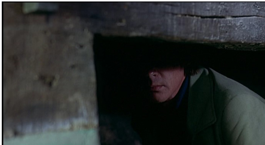
Figure 9: Tableau vivant . The Shout (Jerzy Skolimowski, Recorded Picture Company, 1978).

These tableaux vivants function as more than props or prompts (Figure 8; Figure 9). 21 Going beyond supporting character development and aiding the film narrative, they function to draw attention to the queer potential of Bacon's paintings. In this role, they contribute to the film as art writing. Art writing is writing about art that does not seek to explicate but rather, as a practice, to realize (something about) a work by way of processes akin to repetition or imitation (Rifkin 2021, p. 233). 22 This practice bears some similarity to Serge Cardinal's description of a mode of film writing that allows a film to speak for itself through the writer talking in its language.