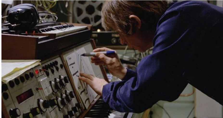
Figure 12: Audio technology and possibility. The Shout (Jerzy Skolimowski, Recorded Picture Company, 1978).

seems to signal the force of the vertical (Ahmed 2006, p. 107). 47 The shout therefore demands a queer orientation for its successful generation. In this, it echoes the scream in Bacon's paintings. In Bacon's paintings, the scream registers pleasure, it is an effect of queer sexual practices. The shout in the film, by contrast, is not a record of ecstasy but its cause . Anthony is overcome by Crossley's noisy ejaculation, falling in a faint, a sonically induced swoon. 48 The other men who buckle at Crossley's shout can similarly be read as exhibiting post-coital quiescence, as victims of a little death ( la petite mort ), rather than of the literal death a straight reading of The Shout invites. 49