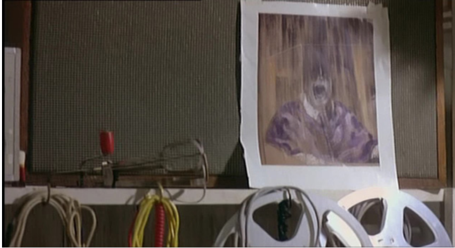
Figure 5: Francis Bacon, Head VI, 1949. The Shout (Jerzy Skolimowski, Recorded Picture Company, 1978).