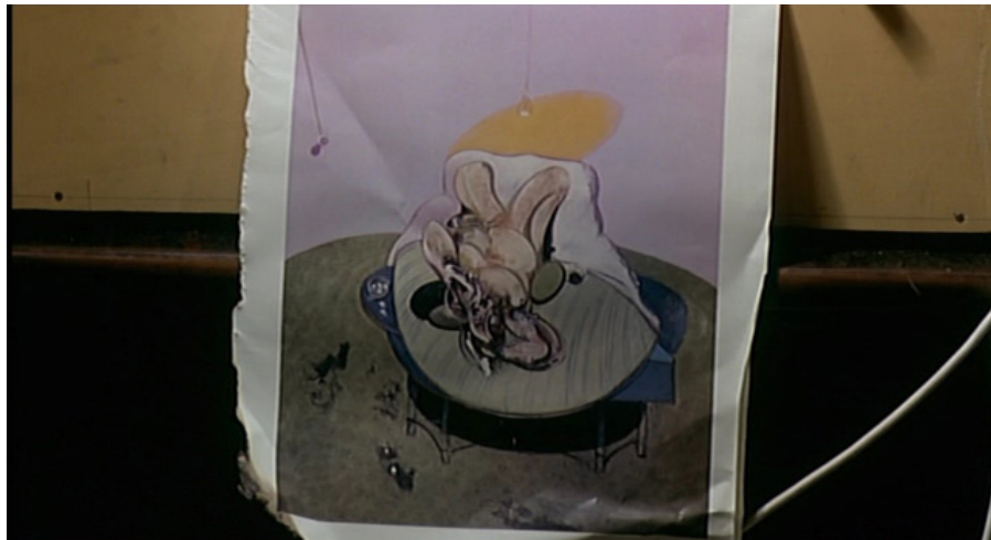
Figure 6: Francis Bacon, Lying Figure, 1969. The Shout (Jerzy Skolimowski, Recorded Picture Company, 1978).