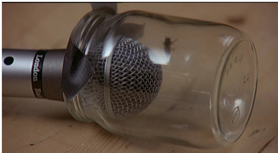
Figure 3: The sound of a wasp buzzing. The Shout (Jerzy Skolimowski, Recorded Picture Company, 1978).

The film The Shout also differs from the story in that the modern artist Francis Bacon is a central point of reference. 5 In 1929 when ‘The Shout’ was first published, Bacon was an interior designer creating furniture. The only art referenced in the short story is seemingly classicist. In Graves’s tale, Rachel tells Richard she had a dream similar to his, about a Black man “who wore a blue coat like that picture of Captain Cook” (Graves 2008, p. 9). 6 The Black man in the blue jacket, part of naval dress uniform, also appears in the film adaptation. The actor in this non-speaking role is uncredited, another nameless ‘exotic’ extra burdened with representing alterity. 7 The First Nations Australian of the film, as a figment of the European imaginary, functions to signal primitivism, to stand for mystery and difference. The shout from which the film takes its title is said to originate with this man, it is a vocal skill that Crossley learnt while living with First Nations Australians and has now brought back to England. Acoustic references to the music of Australia’s First Peoples are also present. In one scene, Rachel is cutting roses and the noise of a wasp buzzing