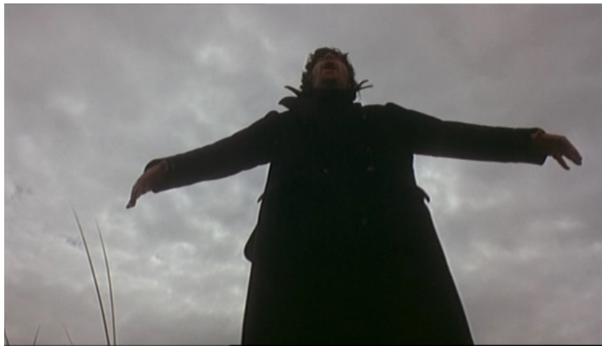
Figure 10: A performance of tumescence. The Shout (Jerzy Skolimowski, Recorded Picture Company, 1978).

In Skolimowski’s film, Crossley’s shout does not readily conform to any of these definitions. He does not seem to shout words thus his shouting is divorced from