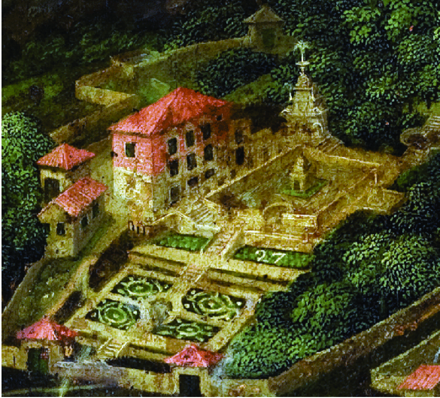
Figure 5. El Bosque of the Dukes of Béjar, Béjar (Salamanca).

Throughout the early modern period in Europe, there was a gradual transformation of the landed aristocracy into a court nobility. 112 Numerous factors shaped this process in Spain, such as the chronic debts incurred by the high nobility and their economic dependence on the crown, in addition to the progressive abandonment of their traditional residences and estates as they assumed an increasing role in the monarchy's politics and government. Absenteeism was endemic among the members of the landed aristocracy who