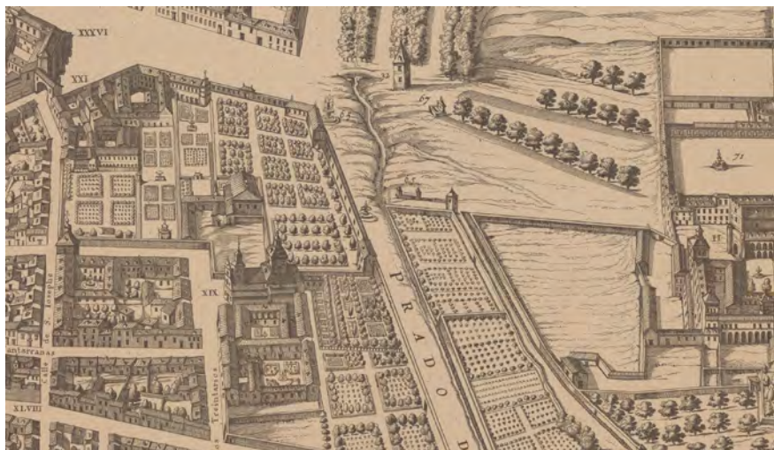
Figure 3. The Lerma palace and garden complex. Pedro Teixeira, Topographia de la Villa de Madrid (Antwerp: Ioannis et Iacobi van Veerle, 1656).

Three noble residences in Madrid—the Marquis of Carpio’s huerta of San Joaquín, the Marquis of Castelo Rodrigo’s La Florida, and the Admiral of Castile’s huerta —rightly gained the greatest fame for their beauty and the extraordinary quality of their collections, while serving as exemplars of the court’s social and political life. The huerta of the admirals of Castile was started by Vittoria Colonna, grandmother of Juan Gaspar Enríquez de Cabrera, 10th Admiral, who turned it into his own village retreat at court. One noble recorded in his diary how amid the splendour of the Enríquez family’s Madrid court, one could enjoy superb “music and chocolate” with “honest conversation,” and that there were also “weighty disputes and confrontations stemming from complaints by some nobles who had not been given positions” by the king. 98