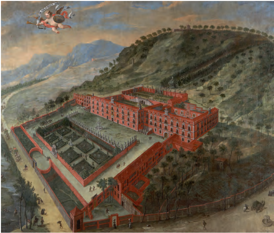
Figure 4. School of Madrid, Huerta de la Florida , oil on canvas, ca. 1670 (Colección Abelló, Madrid).

3rd marquis for his residence at court, after his death in 1675 the neighbouring land and gardens were purchased, expanding the estate to ten times its original size. It was intended as a suburban villa on the banks of the river Manzanares and was surrounded by a boundary wall. It consisted of a palace and various pavilions, fountains, water features, and terraced gardens that displayed a good part of the marquis's exceptional sculpture collection. There were also grottoes, lakes, a dovecote, stables, a chapel, a henhouse, a washhouse, snow-house, water wheel, cattle sheds, and additional gardens for flowers, fruit trees, and vegetables. This exceptional palace complex dominated, for more than a century, the city's north-eastern part at the juncture of the roads from Castile and El Pardo.