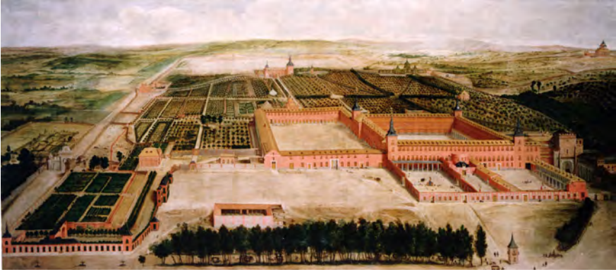
Figure 2. Jusepe Leonardo, Palace and gardens of Buen Retiro ca. 1637, oil on canvas, Madrid. Patrimonio Nacional.

Aside from the principal houses and three convents (those of the Capuchins, Saint Catherine of Siena, and Saint Anthony), to which it was connected by passageways, the huerta had a gallery with views of the prado (meadow), patios, orchards, fountains, flower gardens, a small zoo, an arena, and a bullring. Its special configuration as a space that served to display the duke's noble and political status while also providing for leisurely pursuits and a retreat from court life inspired the construction of other noble residences in Madrid. 96 Other houses with similar flower gardens and orchards were those of the counts of Monterrey in the Prado Viejo, the counts of Oñate, and the counts of Baños in Recoletos as well as the Quinta de Mirafuentes belonging to the dukes of Frías (constables of Castile). 97