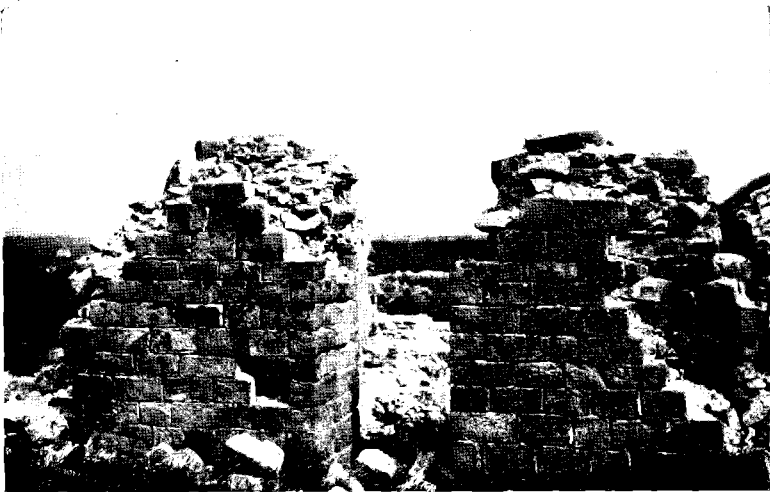
Ruins of Fort Cumberland, N.S., (Photo., Can. Nat. Parks).