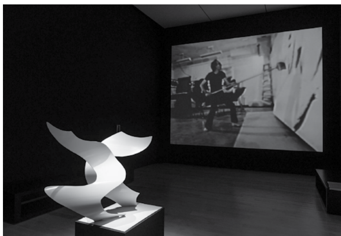
Left. Exhibition Marcel Barbeau en mouvement , Musée national des beaux-arts du Québec, from October 11, 2018 to January 6, 2019. Foreground: La puissance de l'espoir , 1985. Painted steel, 114.3 × 121 × 63 cm. Musée national des beaux-arts du Québec collection, donation of Esperanza Schwartz (1988.118). © Succession Marcel Barbeau/SODRAC (2019). Background: filmed painting/performance by Marcel Barbeau, ca. 1975.

Something this exhibition showed very well is the alternation between moments of abandon and control in Barbeau's work. There are the Automatist works of the mid-1940s and 1950s, recognized as perhaps the most advanced experiments in all-over gestural painting of the time. This changes to a more controlled minimalism in the 1960s with a sometimes calligraphic line, followed by compositions with large areas of black and white confronting and balancing each other, unmoving. Then comes the period of meticulous works using colour and line bent to create optical movement, followed by carefully constructed and coloured formed canvases. The kinetic