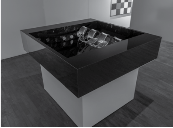
Left. Exhibition Françoise Sullivan, chorégraphie de la matière, Galerie Simon Blais, Montreal, October 10, 2018. Foreground, Océan, 1968. Plexiglas and metal. Background, corner of a painting from the Damiers series (2018).