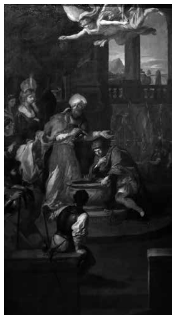
Figure 12 (below). Pierre Puget, The Baptism of Clovis I , 1652. Oil on canvas, 158 × 87 cm. Marseille, Musée des Beaux-Arts.