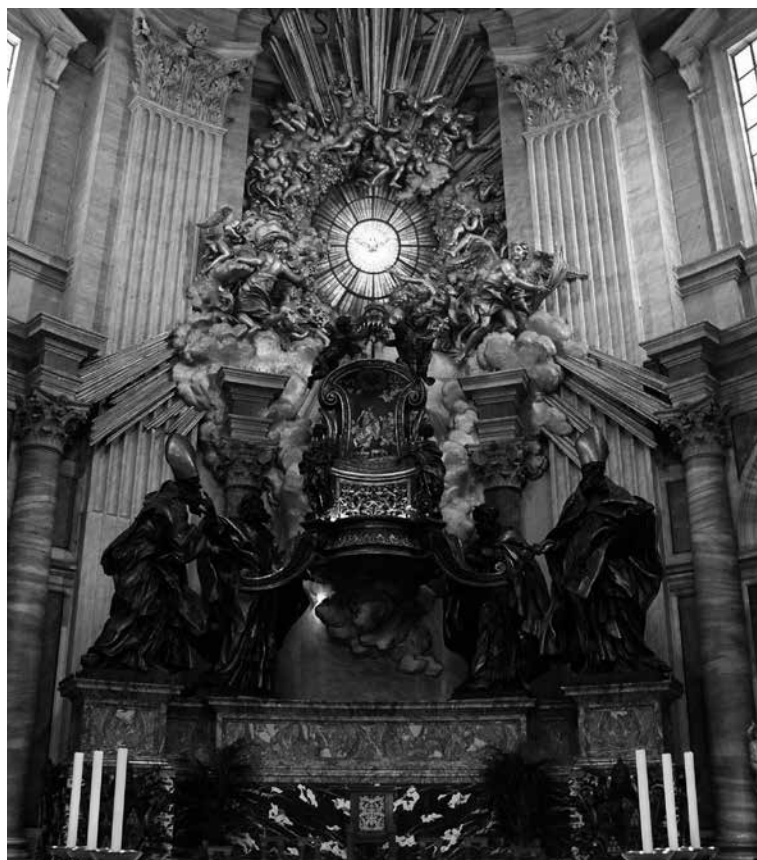
Figure 9. Gianlorenzo Bernini, Cathedra Petri , 1656–66. Gilt bronze, marble, stucco, glass. Vatican City, St. Peter's Basilica.