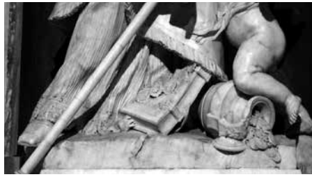
Figure 13. Pierre Puget, St. Alessandro Sauli , detail of base, 1664–67. Marble, over life-sized. Genoa, S. Maria Assunta in Carignano.