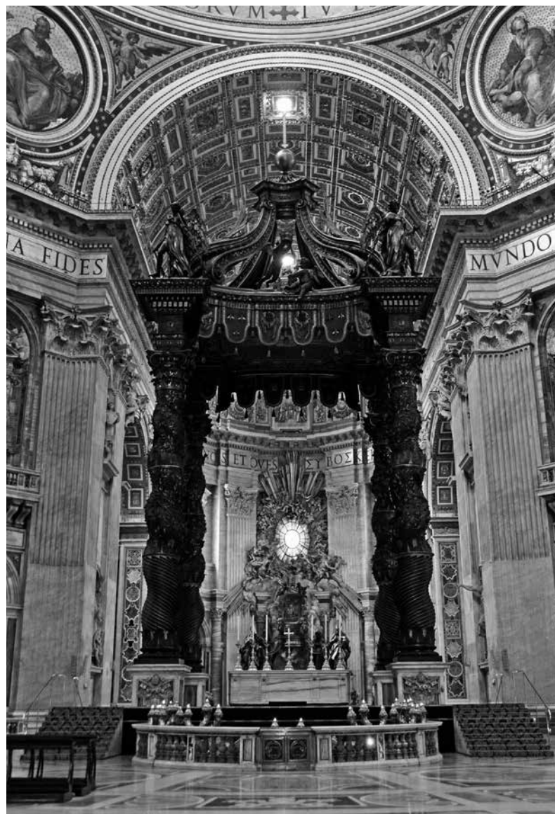
Figure 14. Gianlorenzo Bernini, Baldacchino , 1624–33. Bronze with gilded highlights, 29 m. Vatican City, St. Peter's Basilica.