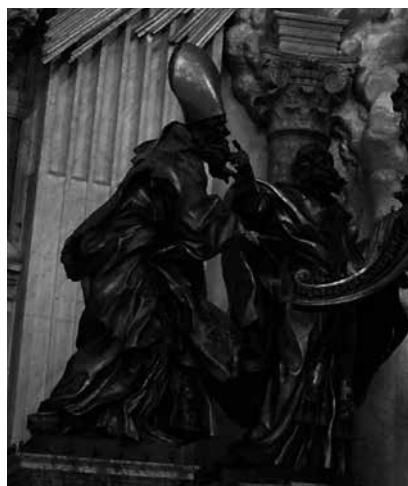
Figure 10. Gianlorenzo Bernini, St. Ambrose and St. Athanasius , detail of the Cathedra Petri , 1656–66. Gilt bronze, over life-sized. Vatican City, St. Peter's Basilica.