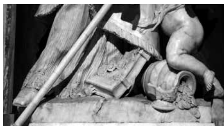
Figure 13. Pierre Puget, St. Alessandro Sauli , detail of base, 1664–67. Marble, over life-sized. Genoa, S. Maria Assunta in Carignano.