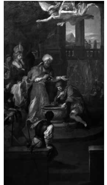
Figure 12 (below). Pierre Puget, The Baptism of Clovis I , 1652. Oil on canvas, 158 × 87 cm. Marseille, Musée des Beaux-Arts.