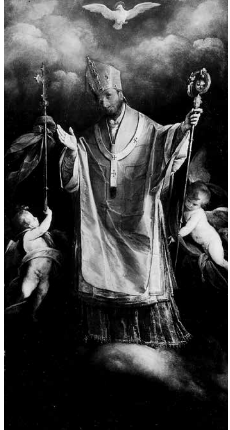
Figure 6. Giovan Battista Crespi (il Cerano), Saint Charles Borromeo in Glory , c. 1615. Oil on canvas, 49.4 × 26.1 cm. Milan, Museo Diocesano.