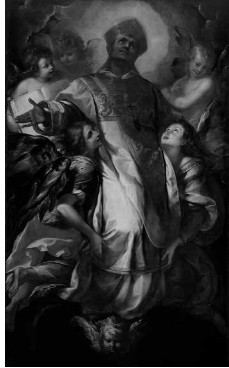
Figure 8. Giulio Cesare Procaccini, St. Charles Borromeo in Glory , 1610–13. Oil on canvas, 285 × 169 cm. Milan, Pinacoteca di Brera.