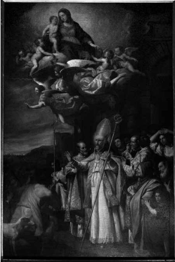
Figure 5. Domenico Fiasella, The Blessed Alessandro Sauli Brings and End to the Plague , c. 1630. Oil on canvas. Genoa, S. Maria Assunta in Carignano.