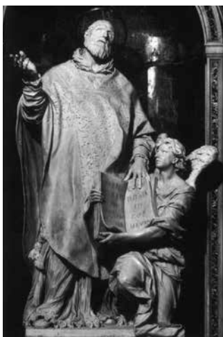
Figure 11. Alessandro Algardi, St. Philip Neri, 1636–38. Marble, c. 300 cm. Rome, S. Maria in Vallicella.