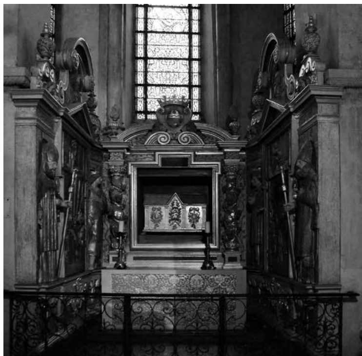
Figure 18. Guillaume Fontan, Chapel of Saint Martial , 1645. Polychrome wood. Toulouse, Saint-Sernin.