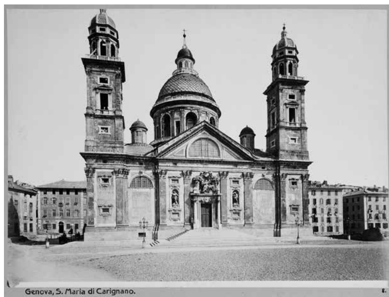
Figure 1. S. Maria Assunta, Genoa. The exterior as it appeared in 1880–1881.

Evidence of Alessandro's cult appears immediately following his death, though centred in Pavia rather than Genoa. 10 The Barnabites produced the first of their several vite in 1600, which is typical of orders promoting their own candidates. 11 The formal processus , or investigation, was launched by the Congregation of Rites in 1623, but ended inconclusively, and a fifty-year