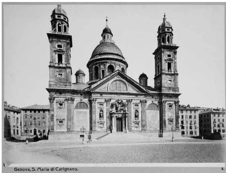
Figure 1. S. Maria Assunta, Genoa. The exterior as it appeared in 1880-1881.