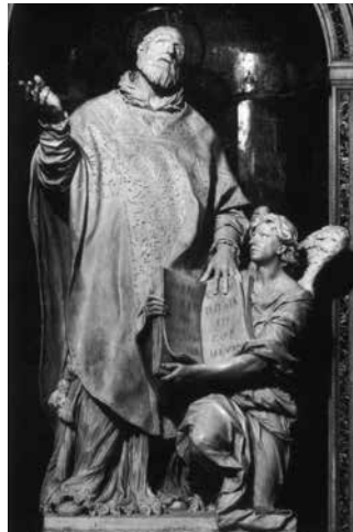
Figure 11. Alessandro Algardi, St. Philip Neri, 1636–38. Marble, c. 300 cm. Rome, S. Maria in Vallicella.