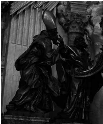
Figure 10. Gianlorenzo Bernini, St. Ambrose and St. Athanasius , detail of the Cathedra Petri , 1656–66. Gilt bronze, over-life-sized. Vatican City, St. Peter's Basilica.