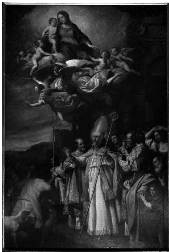
Figure 5. Domenico Fiasella, The Blessed Alessandro Sauli Brings and End to the Plague , c. 1630. Oil on canvas. Genoa, S. Maria Assunta in Carignano.