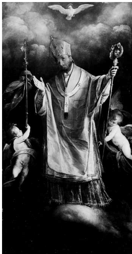
Figure 6. Giovan Battista Crespi (il Cerano), Saint Charles Borromeo in Glory , c. 1615. Oil on canvas, 49.4 × 26.1 cm. Milan, Museo Diocesano.