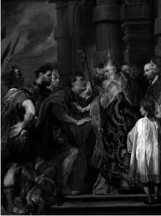
Figure 7. Anthony Van Dyck, The Emperor Theodosius is Forbidden by Saint Ambrose to Enter Milan Cathedral , c. 1619. Oil on canvas, 147 × 114 cm. London, National Gallery.