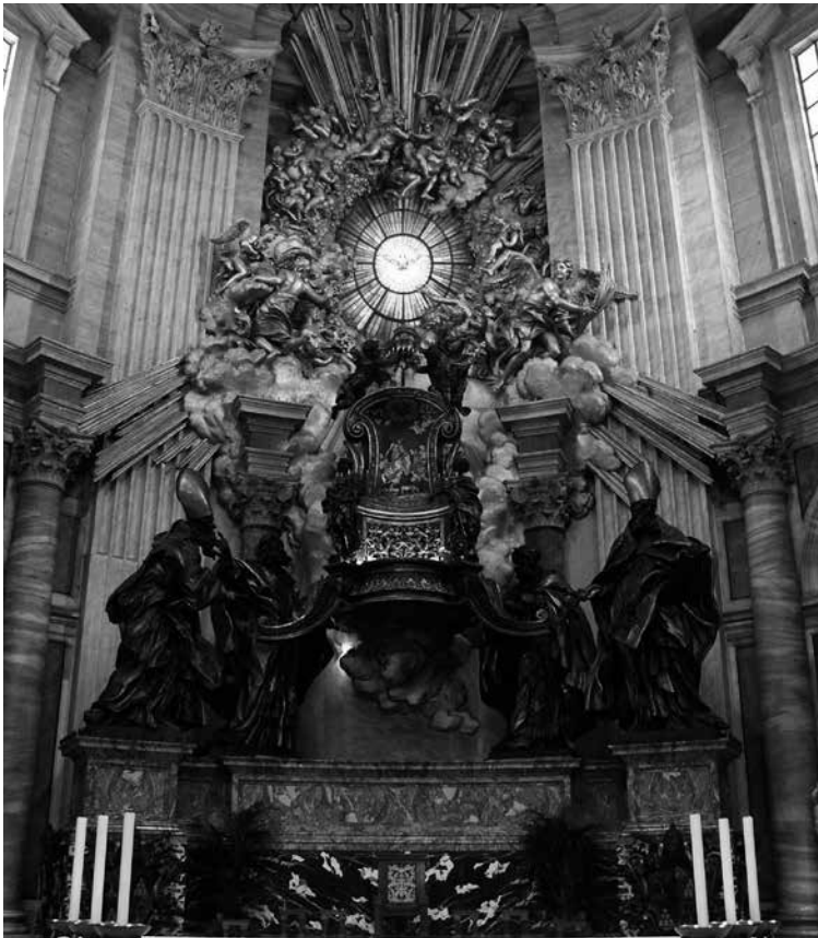
Figure 9. Gianlorenzo Bernini, Cathedra Petri , 1656–66. Gilt bronze, marble, stucco, glass. Vatican City, St. Peter's Basilica.