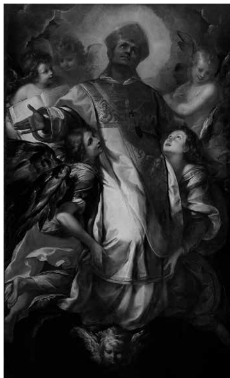
Figure 8. Giulio Cesare Procaccini, St. Charles Borromeo in Glory , 1610–13. Oil on canvas, 285 × 169 cm. Milan, Pinacoteca di Brera.