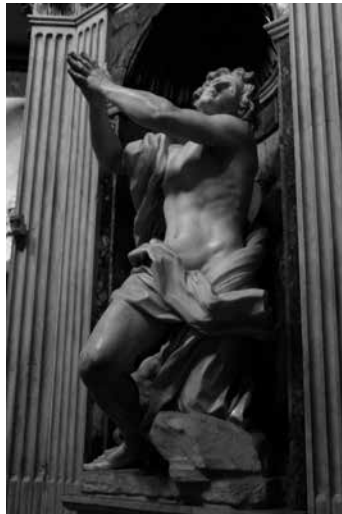
Figure 17. (right) Pierre Puget, St. Anthony of Padua , 1665. Polychrome wood, life-sized. Genoa, SS. Annunziata in Vastato.