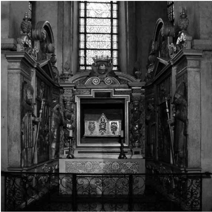
Figure 18. Guillaume Fontan, Chapel of Saint Martial , 1645. Polychrome wood. Toulouse, Saint-Sernin.