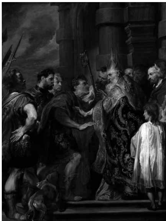
Figure 7. Anthony Van Dyck, The Emperor Theodosius is Forbidden by Saint Ambrose to Enter Milan Cathedral , c. 1619. Oil on canvas, 147 × 114 cm. London, National Gallery.