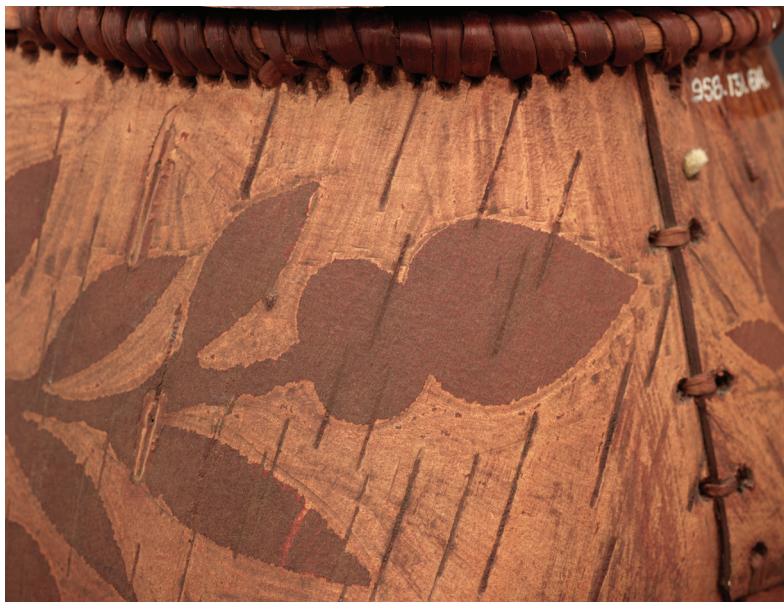
Figure 4. Detail of flower motif on birchbark basket. Collection of the Royal Ontario Museum 958.131.614