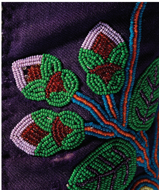
Figure 5. Detail of flower motif on cradleboard. Collection of the Royal Ontario Museum 998.134.3.1