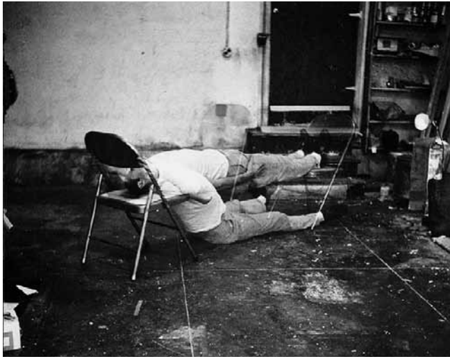
Figure 4. Bruce Nauman, Failing to Levitate in My Studio, 1966. Courtesy of the artist.