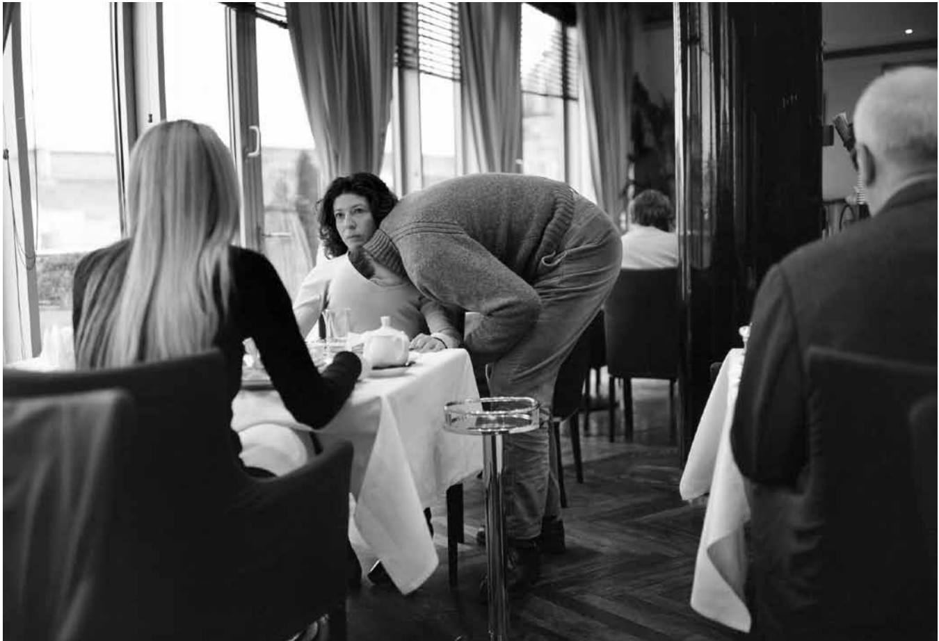
Figure 5. Erwin Wurm, Inspection , 2002, from Instructions on how to be politically incorrect series.

evidenced an openness to determined indeterminacy. For example, one version of Choosing (A Game for Two Players): Green Beans (1971) consists of nine colour photographs arranged in three horizontal rows of three. 44 As an utter counterpoint to something like Edward Weston's beautiful photographs of individual vegetables, each blasé photograph by Baldessari documents three plain green beans. In a sense, this too is a statement of aesthetic withdrawal. While pushing up against the aesthetics of indifference, it points to the ways absurdity may lurk in the banal.