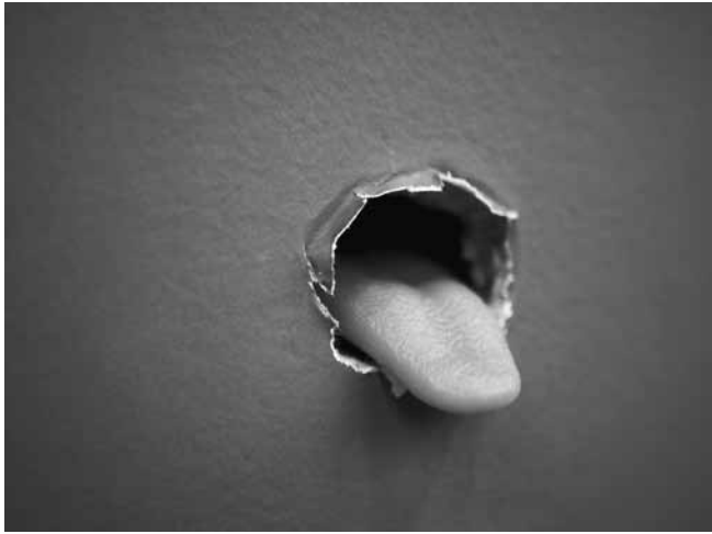
Figure 1. Urs Fischer; Noisette , 2009. Mixed mediums, dimensions variable. Courtesy of the artist; Galerie Eva Presenhuber, Zürich; Gavin Brown's enterprise, New York; and Sadie Coles HQ, London. Installation view: "Urs Fischer: Marguerite de Ponty".