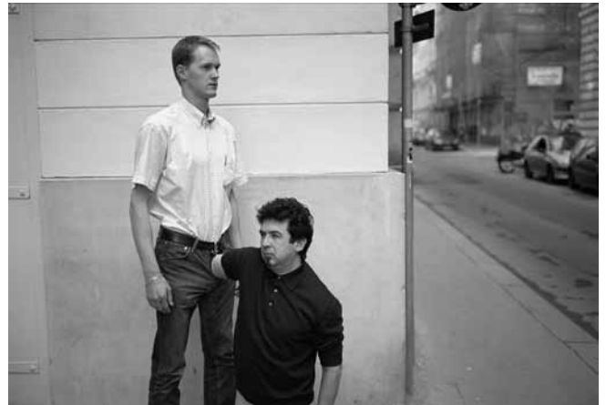
Figure 6. Erwin Wurm, Looking for a bomb 3 , 2003, from Instructions on how to be politically incorrect series.

Connected to this recurrent rejection of hermetic and finite rules in conceptual art practice, comedy itself is not the acceptance of our human limitations, weaknesses, and imperfections, nor is it even a reconciliation of the absence of transcendence. Consider instead how most comedies set up a configuration in which one or several characters depart from the balanced rationality of their surroundings. Something exceeds ordinary expectations. 50 Tom Friedman’s 1996 Untitled is a more contemporary example of the legacy of comedic conceptualism. It shows “a comically oversized man-shaped hole in a landscape as if someone had fallen from the sky.” 51 As a wry “spoof on the heroics of land art,” the photographic documentation of this “classic animated cartoon moment” 52 at once defies gravity (read as seriousness in art) and succumbs to gravity in creating a monumental gravesite. Brought into perspective through larger-than-life lenses, such comic antics provide conceptual disorientation. Even after falling the subject somehow keeps coming back for more. The artist Peter Land, for instance, seems to never cease plummeting. In his video Pink Space (1995) he is dressed as an entertainer, in a bowtie and blue lamé jacket. With a drink in hand he approaches a stool in the centre of the spotlight stage. Repeatedly, he attempts to take a seat but falls to the ground.