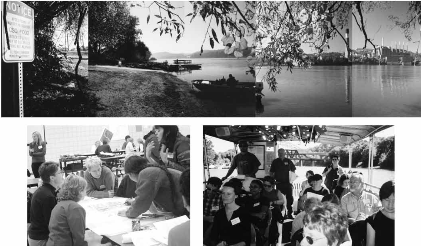
Figure 2. Images from 3 Rivers 2nd Nature: the post-industrial condition—dirty water and aging industrial infrastructure; interested parties and potential advocates on the rivers and at the public design tables.