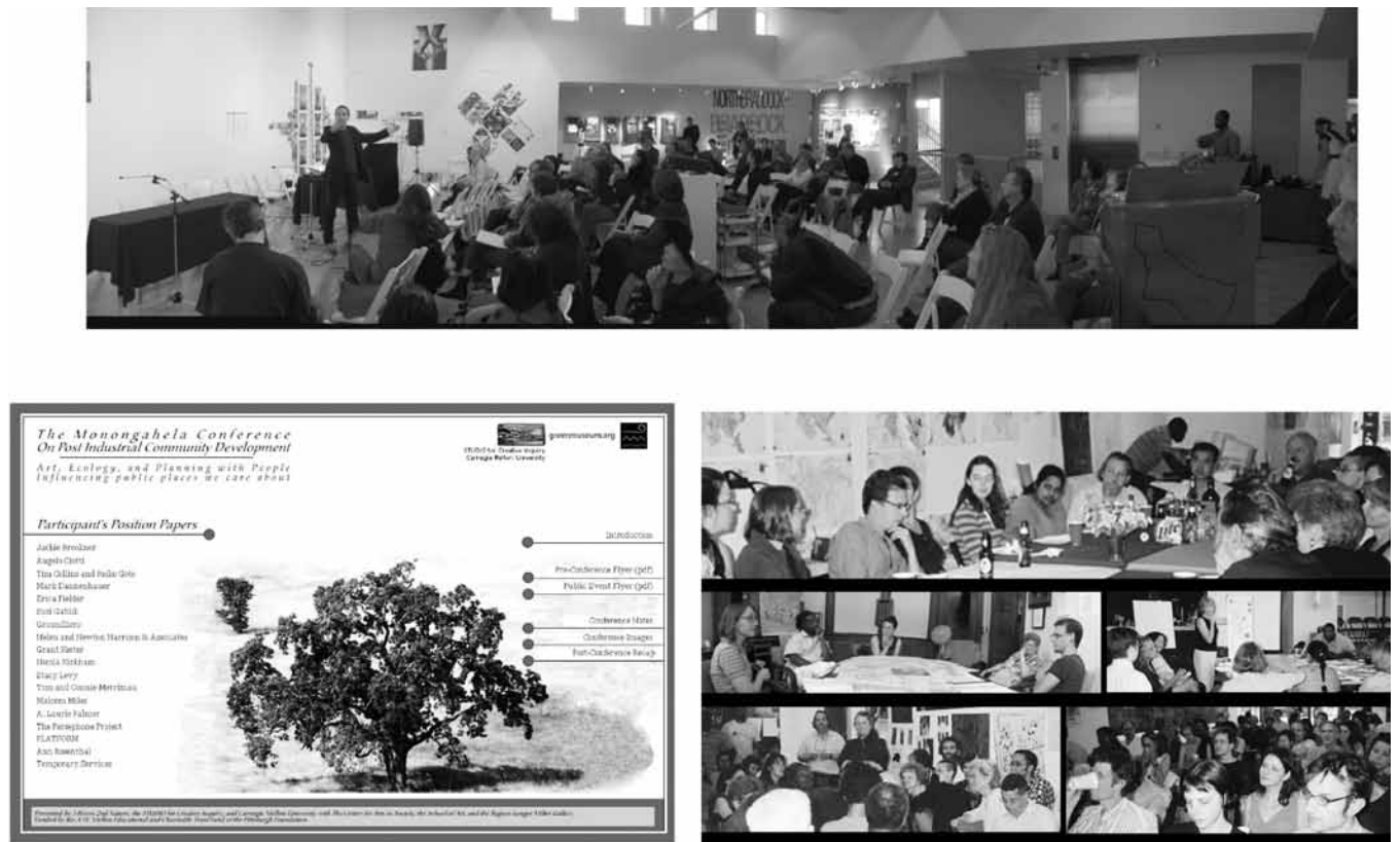
Figure 3. The Monongahela Conference Programs: Grant Kester provides the closing keynote for the 2005 conference, Friday-night dinners, and public meetings from the Monongahela Residencies; and the Greenmuseum website/archive from the first Monongahela Conference. 3 Rivers 2nd Nature, STUDIO for Creative Inquiry, Carnegie Mellon University.

place-based interests and practices yet recognizing the significant differences and challenges when you look at this work as an international field of practice, functioning in situ without significant institutional presence.