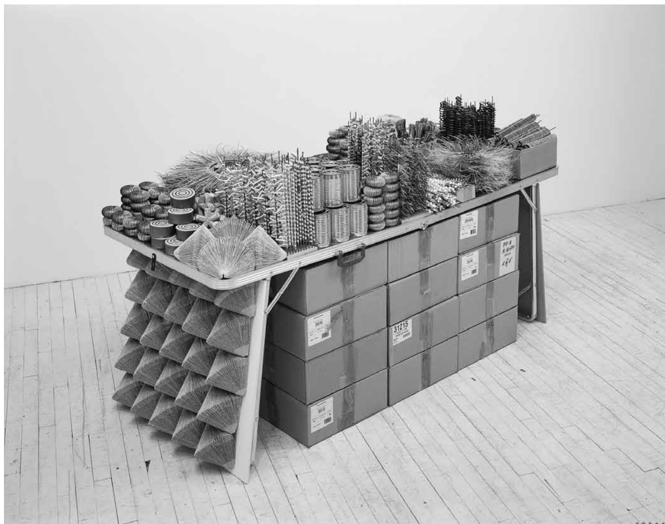
Figure 1. Jérôme Fortin, New York, New York , 1996–2005. Mixed media. Collection of the artist.

are actually made from strips of cut plastic bottles, a jarringly permanent material.