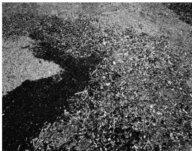
Figure 3. Edward Burtynsky, China Recycling #8, Plastic Toy Parts , Guiyu, Guangdong Province, China, 2004. Chromogenic colour print.

In many ways, Joseph Mallord William Turner's paintings epitomize the scenario of the Burkean sublime, in which nature is a malevolent atmosphere that threatens to obscure sight and overwhelm thought. In Snow Storm: Steamboat off a Harbour's Mouth (1842, fig. 2), for example, ocean, cloud, and sleet combine in a swirling tidal wave to descend on a barely discernable ship, located in the eye of the storm at the centre of the canvas. Similar in composition, Burtynsky's China Recycling #8, Plastic Toy Parts (2004, fig. 3) depicts curvilinear bands of colour that rear into an array of sky blue, muddy black, and gray punctuated with bursts of red, pink, and yellow. Fluid as this vortex of colour appears, it is not a rancorous tempest but a heap of trash: