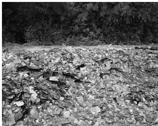
Figure 5. Edward Burtynsky, China Recycling #9, Circuit Boards, Guiyu, Guangdong Province, China, 2004. Chromogenic colour print.