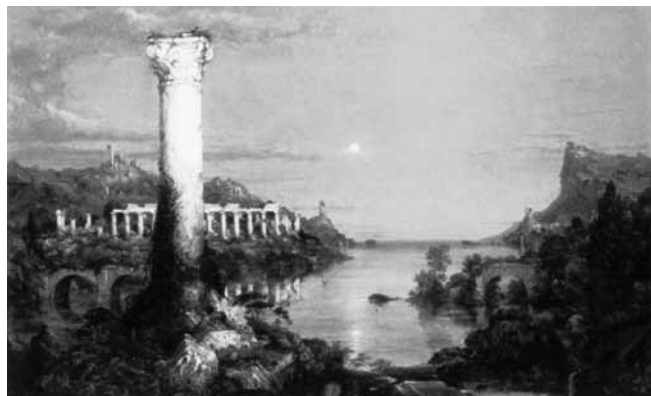
Figure 4. Thomas Cole, The Course of Empire: Desolation , 1836. Oil on canvas, 39 1/4 x 63 1/4 in. Collection of The New-York Historical Society.

Burtynsky’s China Recycling #9, Circuit Boards (2004, fig. 5) presents a comparable meeting of ruins and nature. Here, an undulating pile of rusting circuit boards (once again, seemingly fluid) laps at the edge of a treeline. Divided by a narrow dirt pathway that functions as a horizon line, there is a confrontation at play between the vegetation in the background and the detritus in the foreground. But instead of the contemplative atmosphere of Cole’s Desolation , this ambivalent encounter between the natural and the artificial shifts the balance from the theme of nature’s perseverance to that of the endurance of