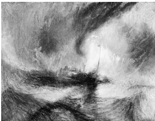
Figure 2. Joseph Mallord William Turner, Snowstorm: Steamboat off a Harbour's Mouth , 1842. Oil on canvas, 91.4 x 121.9 cm.

the Sublime,” nature is dispelled into enigmatic sensations that are translated, through subreption, into representations that are merely analogous to the magnitude of reason. In this way, the sublime aesthetic is rooted in a determination to gain “dominion” over nature. 20