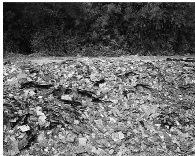
Figure 5. Edward Burtynsky, China Recycling #9, Circuit Boards, Guiyu, Guangdong Province, China, 2004. Chromogenic colour print.

human history. The archaeologist William Rathje argues that our garbage is replete with historical information, and insofar as it has always been the material basis of archaeological study, it is also at the heart of our understanding of contemporary society. 22 The landfill, he suggests, is the site of our modern-day ruins and artifacts. Burtynsky’s series mobilizes garbage in this way, targeting the end of the economic chain of production and consumption as the locus of human-nature contact, in much the same way that Cole pictures the end of civilization as a strategy to reveal the natural presence that always underlies human activity.