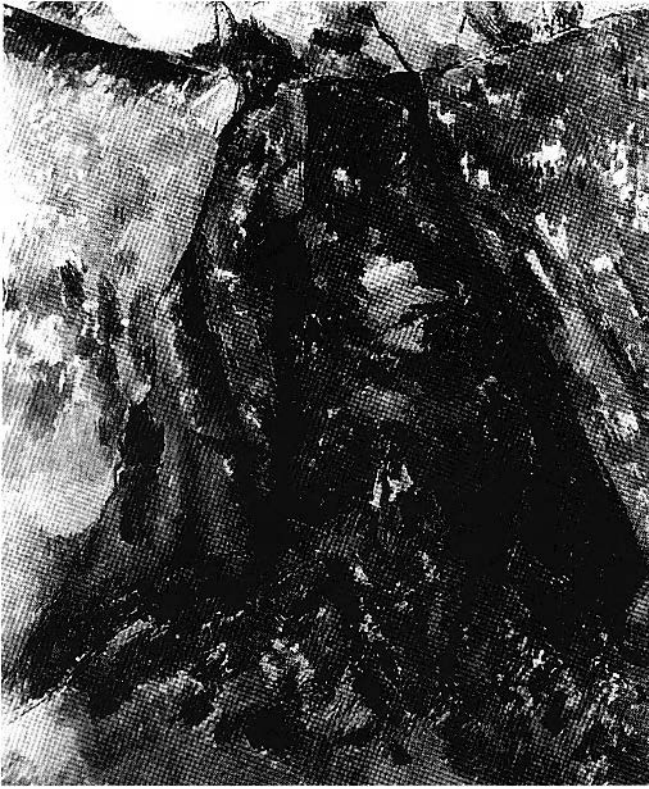
Figure 7. Paul Cézanne, Dans la Carrière de Bibémus , ca. 1895. Oil on canvas, private collection (Photo: reproduced in Nina Maria Athanassoglou-Kallmyer, Cézanne in Provence: The Painter in His Culture , Chicago and London, 2003, 170).

that they can make reference to gravity, to erosion and an increase of entropy, but never succumb. And this creates a remarkable tension: what the tache is holding back is the rock's absolute indifference, and ultimately resistance, to the tache's own timescale. It seems a very thin container for the millions of years the earth's processes have spent arriving at this point, and an even thinner barrier against the millions to come.