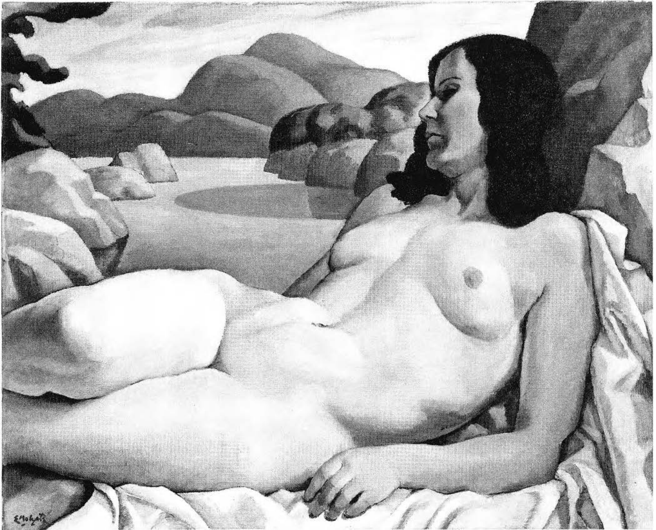
Figure 2. Edwin Holgate, Nude in a Landscape , ca. 1930. Oil on canvas, 73.1 x 92.3 cm, Ottawa, National Gallery of Canada, (Photo: National Gallery of Canada).

of black female sexuality as beyond “natural” limits. The represented black body is not within nature but separated from it. “Black Woman” is constructed as sexual spectacle for the white viewer.