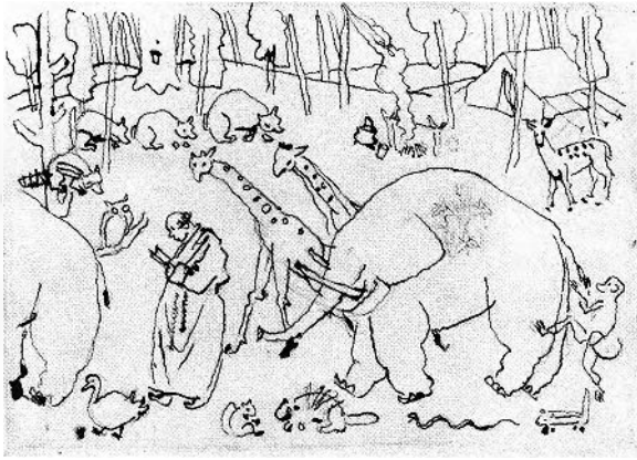
FIGURE 4. David Milne, The Saint (Milne?), 1944. Transfer drawing for an unpublished colour drypoint (cat. 84).

on which these colours and forms glow. These effects also appeared in his paintings and drawings, works Milne called 'memory pictures'. Done rapidly with the precise elements reduced to an absolute minimum such that they were 'furthest from the realistic,' Milne was still seeking 'a strong kick from the subject (p. 126).' Interestingly he never broke completely with nature as the source of his art; he never went completely abstract.