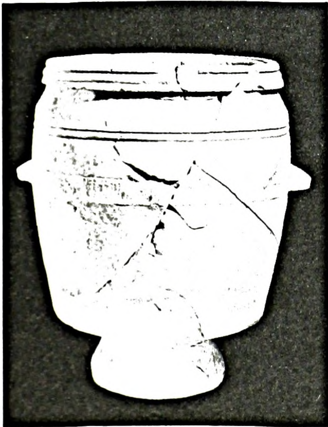
FIGURE 1. Stone vessel. Yadin, p. 48.

The Islamic Garden offers the student of garden history, and of Islamic culture, significant rewards. Not the least of these is Richard Ettinghausen's cogent justification of a selective cross-cultural, rather than strictly regional, presentation of the subject. Like Islam itself, the Islamic garden exists as a nexus of attitudes and responses which have been translated into the visual languages of societies as diverse politically, and as distant physically, as Umayyad Spain and Safavid Iran. But while cultural idioms may have varied, basic expressive relationships – the relationship of artificial to 'natural,' of garden setting to architectural focus, of walled to non-walled areas – demonstrate a binding continuity over space and time. The streams that nourished the Islamic garden flowed out from a single, central source, as Ettinghausen suggests. The fact that the five essays which follow the introduction elaborate specific aspects of this perceptive text imposes upon the collection a thematic structure