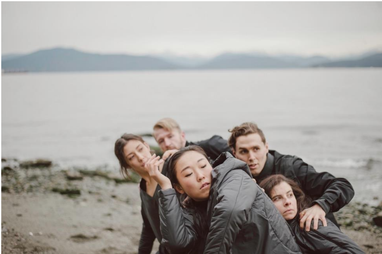
OURO Collective exploring the relation between movement and environment at Spanish Banks Beach in Vancouver.