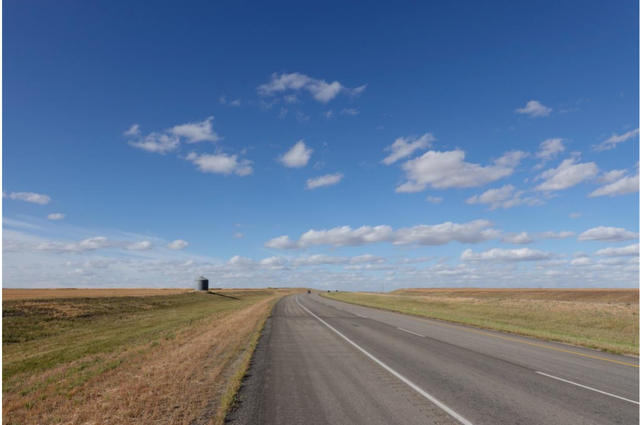
A grain bin beside the highway during harvest. Regina Bypass, northwest of Regina, Saskatchewan, September 2020.