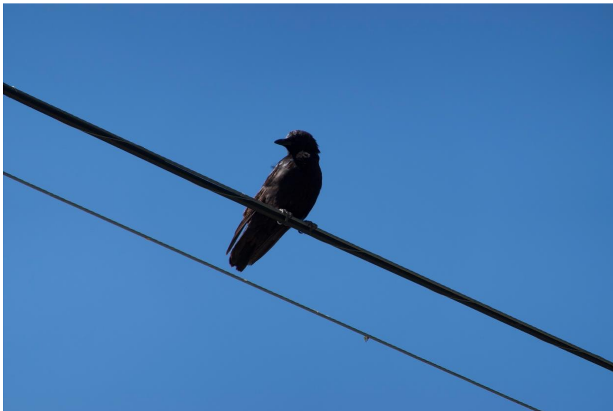
An urban crow. Regina, Saskatchewan, June 2020.