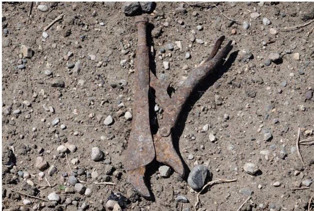
Long forgotten on the edge of a grid road. West of Regina, Saskatchewan, June 2020.