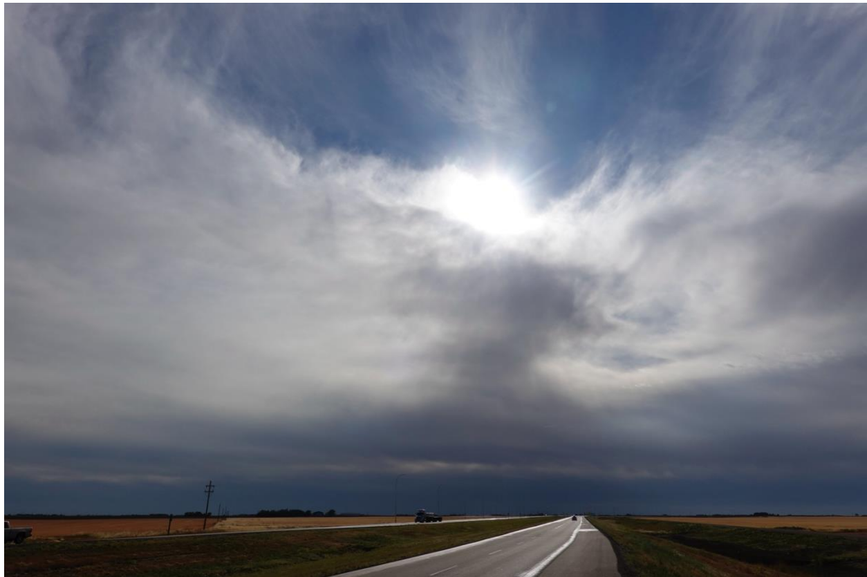
After the rain. Regina Bypass, south of Regina, Saskatchewan, September 2020.