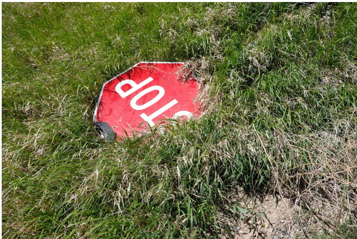
An abandoned road sign. Regina, Saskatchewan, June 2020.