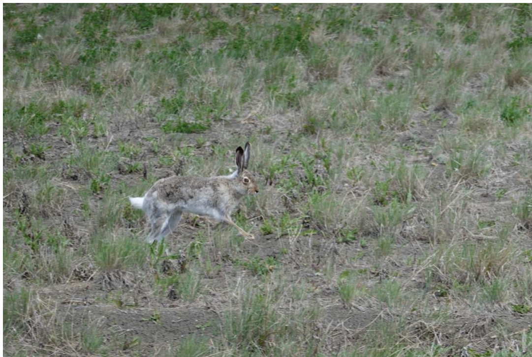
A city rabbit in a vacant suburban lot. Regina, Saskatchewan, June 2020.