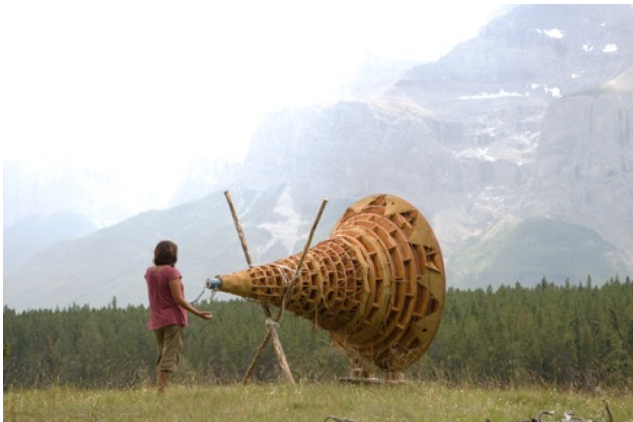
Rebecca Belmore, Ayum-ee-aawach Oomama-mowan: Speaking to Their Mother (1991). Gathering, Johnson Lake, Banff National Park, Banff, Alberta, July 26, 2008. Presented by the Walter Phillips Gallery as part of the exhibition Bureau de Change, July 12–September 28, 2008. Image courtesy Rebecca Belmore and the Walter Phillips Gallery, Banff Centre for Arts and Creativity. Purchased with the support of the York Wilson Endowment Award, administered by the Canada Council for the Arts. Accession #P08 0001 S.

In an image from Wave Sound (2017), a person kneels on the grass at Green Point in Newfoundland, Canada, listening through a large aluminum cone directed toward the body of water below the cliff. Located on Mi'kmaq land, Green Point was incorporated into the settler state as Gros Morne National Park in 1973, following Newfoundland's 1949 confederation with Canada. While Ayum-ee-aawach Oomama-mowan had not previously been performed at Green Point, it had been performed on Mi'kmaq peoples' lands during the work's 1992 tour, when the megaphone was used on Citadel Hill in Halifax, Nova Scotia—a site where English settlers have maintained a fort since 1749 and where Parks Canada maintains a living history program that invites contemporary settlers to dress in costume, fire a rifle, and become a “soldier for a day,” per their website. While the Parks Canada program demonstrates how settler-colonialism relies on continual reperformances, the sonic returns staged by Belmore's two works on Mi'kmaq lands unsettle Canada's claim to possess these “national” spaces, resituating them as Indigenous lands. Especially since the context of Wave Sound's commissioning meant that the three aluminum listening devices were likely to be used primarily by non-Indigenous visitors to the national parks, Belmore shifted the vantage point from speaking to listening for the 2017 installations.