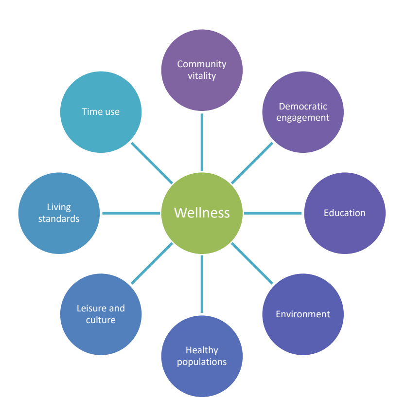
Figure 1. Eight domains from the Canadian Index of Wellbeing

This definition, as well as the domains and indicators used in the CIW, were developed through a broad cross-Canada consultation process that included "national leaders and organizations, community groups, research experts, indicator users, and importantly, the Canadian public" (Canadian Index of Wellbeing, 2016, p. 14). Three rounds of consultation invited Canadians to share what wellbeing means to them in an effort to ensure that the resulting index reflected the lives and aspirations of real Canadians. The outcome was the emergence of eight domains that impact wellbeing, as shown in Figure 1. The domains are, of course, interrelated, with changes in one domain often impacting other domains as well.