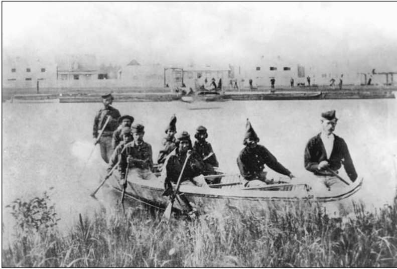
A diverse voyageur crew at Fort William. The folksong repertoire grew during long journeys through the pays d'en haut, as coureurs des bois and voyageurs adapted, improvised, and composed together.

rhythm and synchronicity for the labour of the bûcherons and raftsmen . Instead, the lumbering camps offered an incredibly diverse working environment of Irish, English, American, Scottish, and Aborig-