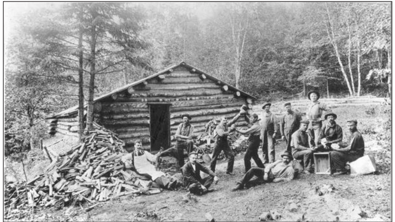
Many voyageurs employed by the North West Company eventually turned to lumbering and carried on the folksong tradition.

explicitly to paddling, for instance “Nous remerons tous tour à tour, nous ramerons tous ensemble!” 83 Another seems to possess British influence: “La ré-zi-gne zign’ boum boum boum: Victoria, Victoria, La ré-zi-gne zign’ boum boum! boum!” 84 This song, representing the most popular verse of the voyageurs, was also undoubtedly very popular amongst the