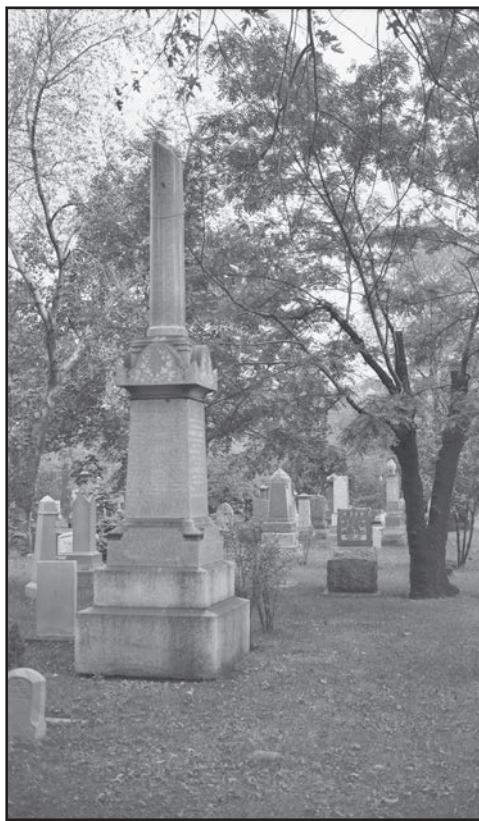
Necropolis Memorial.

went on to a knighthood and nearly became prime minister. Resurrecting inter-provincial grudges charged a crowd to a greater degree than did apotheosizing the dead or idealizing the present. Obviously, the myth of 1837 offered the prospect of providential optimism (their deaths gained us our liberties). Equally as patent, the fund-raisers and inscribers declined to utilize this consolation, preferring instead to remember the pair as patriots rather than as forerunners and atoners. And with no recorded notice