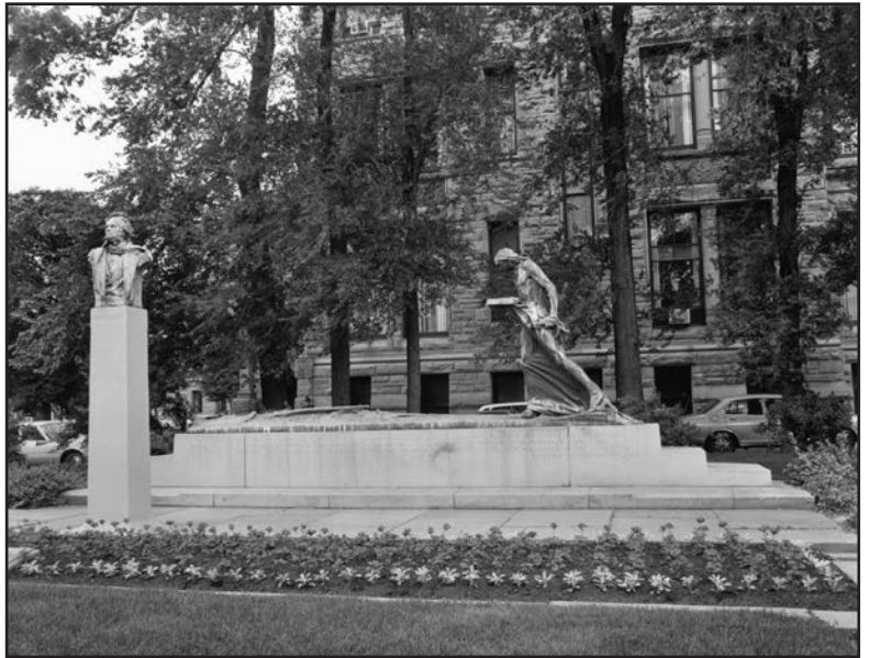
William Lyon Mackenzie Memorial in Queen's Park.

tute as Mackenzie King could seize upon. To mark each of these four phases—heroic revisionism, rehabilitative consensus, suppression of opposition material, reconfiguration of popular historical narrative—I have selected a representative,