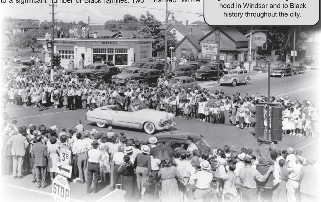
Emancipation Celebration Parade on Ouellette Avenue at Giles Boulevard, Windsor, c.1950.

Records relating to the residents, past and present, of the McDougall Street Corridor Neighbourhood in Windsor and to Black history throughout the city.