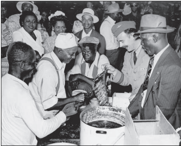
"Late Night Snack": Emancipation Celebration festivities at Jackson Park, Windsor, c.1944.

neither collection is processed at the time of writing, it is anticipated that they will be ready for researchers in the spring of 2007.