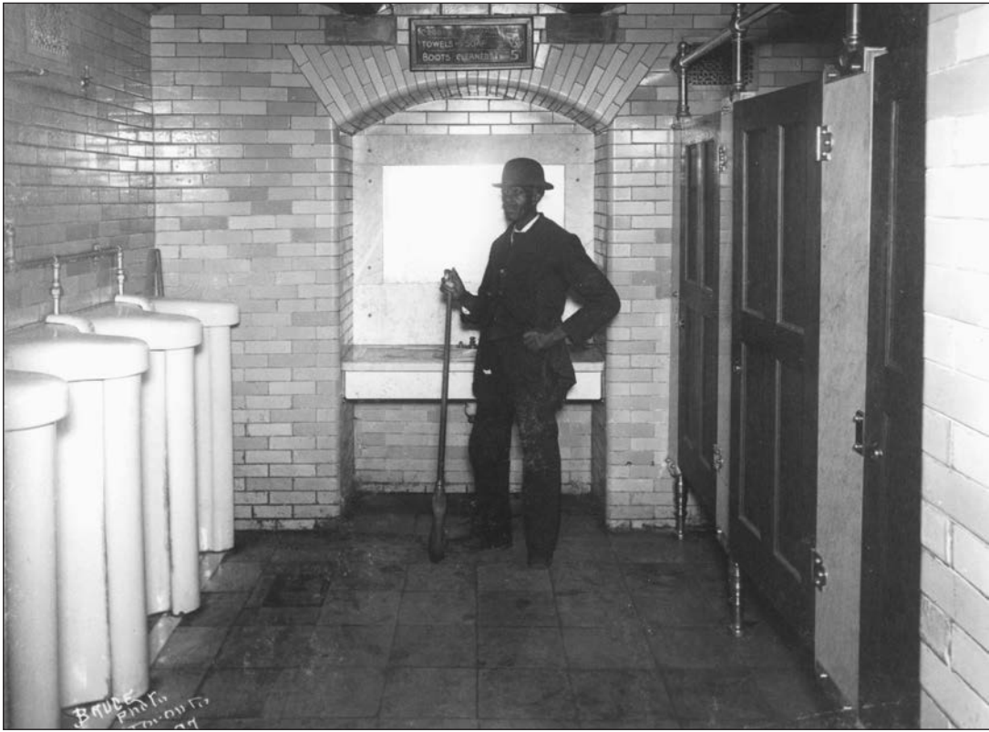
Blacks in Toronto in the 1880s were often confined to low-skill occupations in service-oriented jobs such as this public washroom attendant.