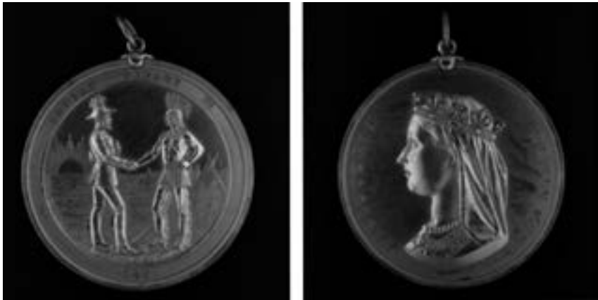
FIGURE 1 Indian Chiefs Medal

In many ways, the negotiation of treaties in present-day Saskatchewan was mutually beneficial for the Crown and First Nations. First Nations wanted assurance that they would be protected with the arrival of settlers and took various actions like denying passage to settlers until the Crown agreed to sign treaties. As Gerald Friesen (2002: 137) explains, concluding treaties was also in the Crown's interest: