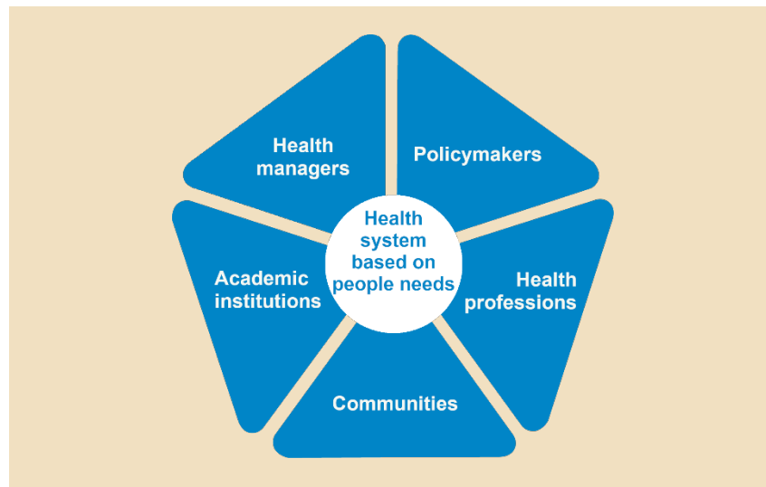
Figure 1 Towards Unity for Health (TUFH) Model