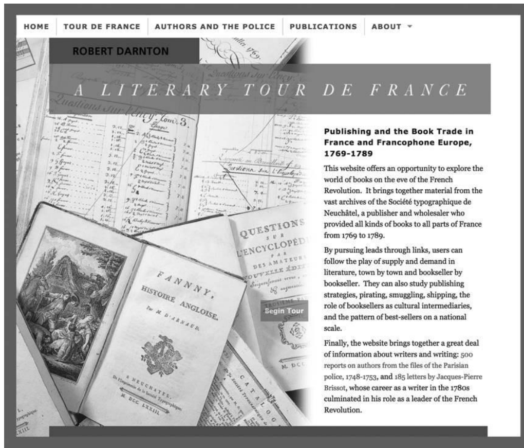
Figure 1: Home page of the website www.robertdarnton.org . A color version of this figure is available online.

It is arranged in layers so that readers can drill down and search across bands of information, pursuing interests of their own as well as the central question of literary demand. Before setting out, however, they are likely to raise questions about methods and sources. A third purpose of this article is to discuss those questions in a way that could be useful to historians in other fields who need to develop an effective research strategy.