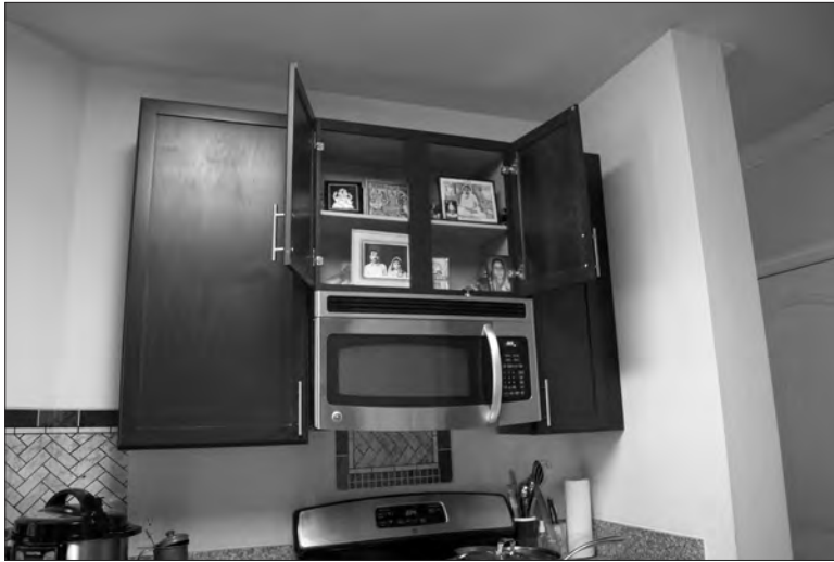
Fig. 3 A home shrine assembled in the cabinet above the microwave in an apartment in central New Jersey. The top shelf has been devoted to the deities, while the shelf below contains photos of dead family members.