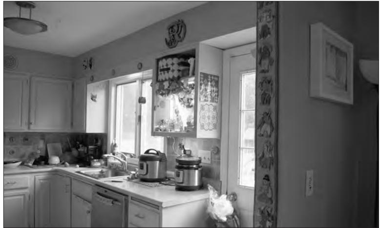
Fig. 15 A home shrine next to the window above the sink.

Many women I met refrained from any constructions or architectural adaptations and adjustments if they could find a home that provided a separate room for the home shrine. A separate room allows individual worship and social celebration in the same space without concerns over moving furniture out or leaving a room unfurnished. Often Hindus in the market to purchase a house request realtors to find them a house with a small room. Instead of describing it as a worship room, women request to see houses with a large pantry or sunroom. Vathsala pointed out that formal living rooms are too large. Traditional worship rooms are small in