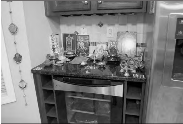
Fig. 13 A home shrine on a kitchen counter above the oven.