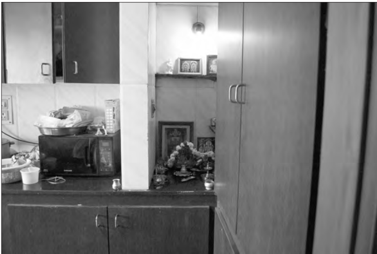
Fig. 2 A shrine corner constructed with a wall inside a kitchen in a home in Bengaluru, India.

note a “hierarchical spatial arrangement” of Hindu domestic architecture (1993: 42). Rooms inside traditional Hindu houses are ranked in hierarchical order of sacred, semi-sacred, neutral, and profane. After the worship room, the kitchen and the threshold (which marks the division between the sacred and the profane) are considered the second most sacred spaces. The pantry, transitional spaces such as hallways near the worship room, and the dining area, where food is consumed, are considered semi-sacred. Worship rooms are wedged sometimes between