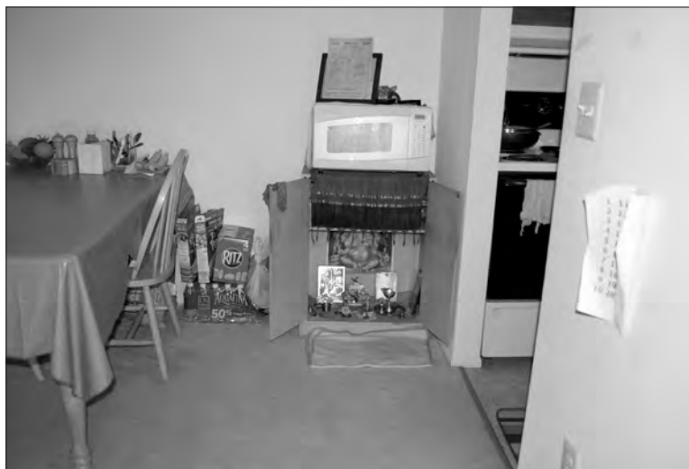
Fig. 5 The home shrine situated in a cabinet under the microwave.

the floor. In all three cases, production of sacred space is achieved through creative incorporation of inbuilt provisions with store-bought furniture like chairs or wooden cabinets that enable the American kitchen to satisfy dual purposes as sacred spaces for cooking and family worship. Without these incorporative practices, women like Rupa find themselves constantly apologizing to their family gods who are setup directly on the kitchen counter. Although Mansi did buy a mandap , it was viewed as unwise on a short term visa. Secular furniture that can be bought for a cheap price and can be easily disposed is generally preferred as a temporary solution.