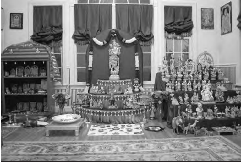
Fig. 18 A sunroom converted into a worship room with the permanent home shrine on the left and the temporary kolu shrine in the center and right of the room.