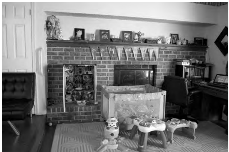
Fig. 17 A shrine nook constructed in the wall of the fireplace.