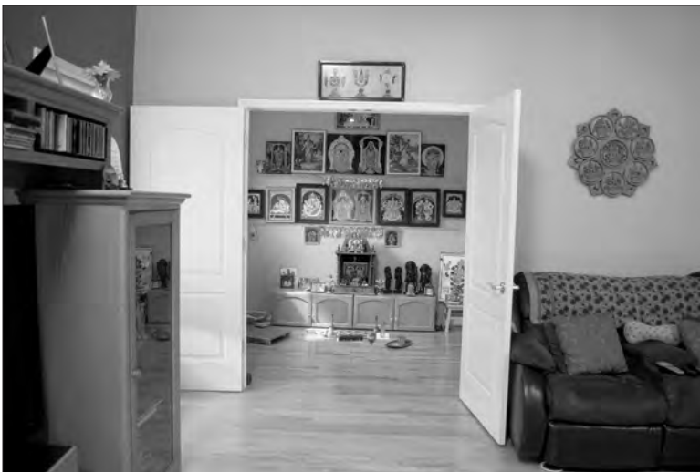
Fig. 19 A custom-made worship room constructed next to the family room.

size to accommodate spatial needs of gods and not humans. Since humans are mobile, they need larger rooms, but that is not the case with gods who due to human devotion and religious desires are permanently stapit (seated) in the house. To give deities a room meant for human living appears disrespectful to divine needs.