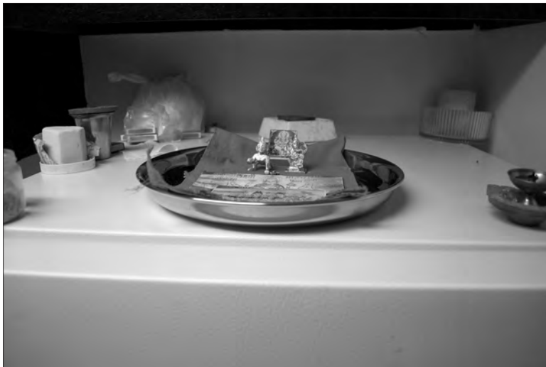
Fig. 4 A home shrine arranged on a steel plate placed on the refrigerator surface in an apartment in central New Jersey.

want to set up the shrine in a cabinet near impure garbage cans or dishwashers associated with uncleanness. 4 However, upper cabinets are not problem-free either. They prevent women from sitting on the mat and offering prayers, which is the more traditional form of domestic worship. 5 Even though some devotees are willing to stand and worship, upper cabinets present further challenges due to the shelves they contain. Since home shrines consist of murtis of multiple gods, and women hesitate to put some deities on shelves higher than others, it appears disrespectful to