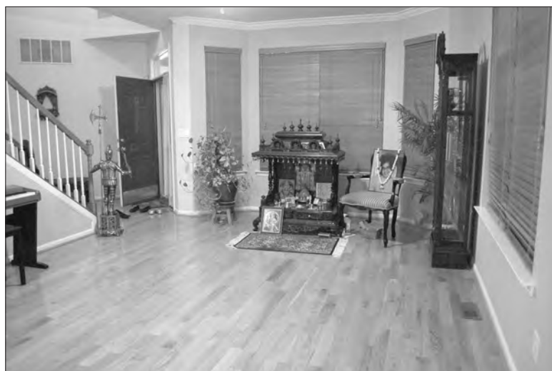
Fig. 11 A formal living room converted into a worship room with a shrine near the entrance of a single-family home in central New Jersey.

Although I often found kolu shrines set up in finished basements, Gayatri’s formal dining room festival setup works out much better. Basement shrines, as some informants explained, split the festival throughout the house. Women walk down to see the shrine, and then walk up to eat. Formal dining rooms converted into festival rooms pack the festival into one room. It enables easy access to the kitchen, where food is cooked and served to women seated in the kolu room, without the need to walk up and down any staircase either for the host or guests.