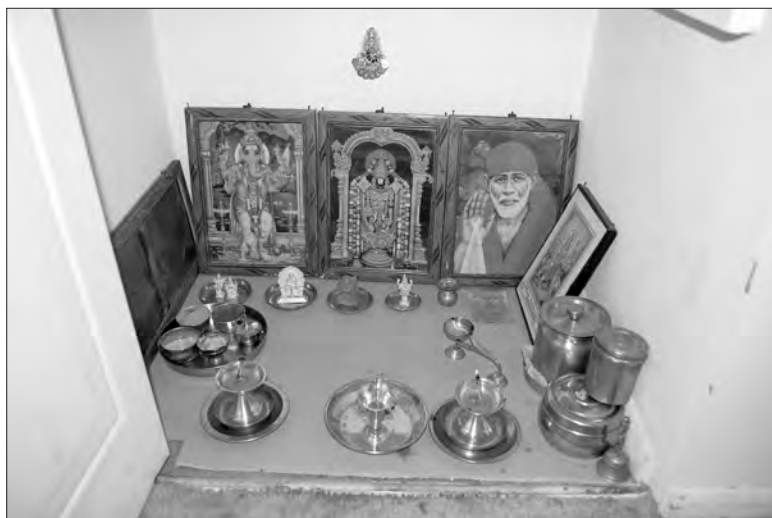
Fig. 7 A shrine within the pantry of the kitchen.

tion, women do not feel their movements into the dining area as limiting as entrance into a separate room like the kitchen. 7