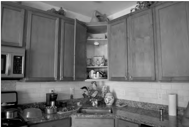
Fig. 14 A home shrine in the cabinet above the sink.

cause unlike cabinets close to the cooking range or counters used for cutting and preparation of food, cabinets over sinks do not require women to reach out for any spices or ingredients. Setting up the home shrine above the sink, used for washing vegetables before cooking or cleaning utensils after meals, does not interfere with preparation of food. Since home ownership provides more