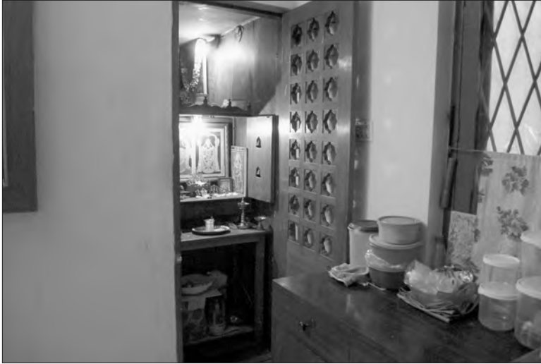
Fig. 1 A worship room wedged between the kitchen and dining area in a home in Bengaluru, India.