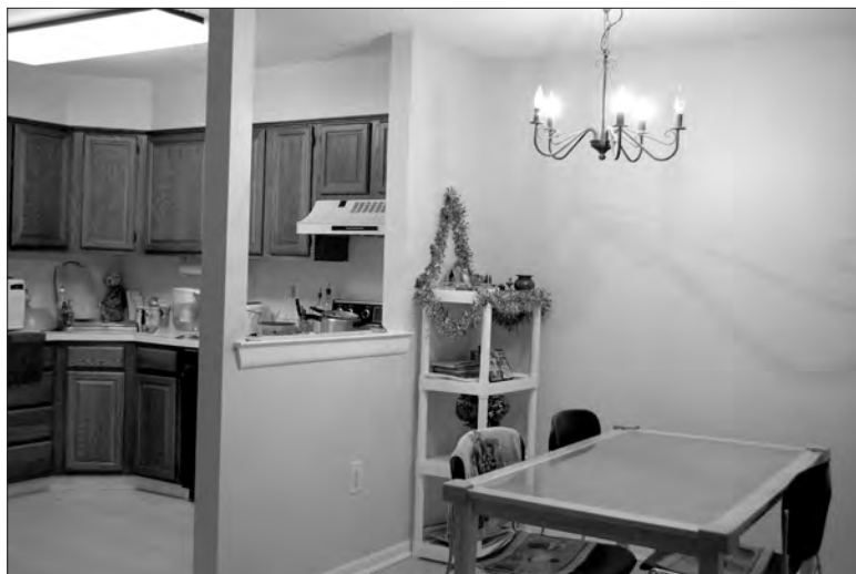
Fig. 6 A home shrine in a corner of the dining area.