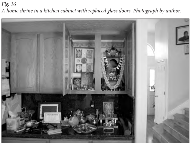
Fig. 16 A home shrine in a kitchen cabinet with replaced glass doors.