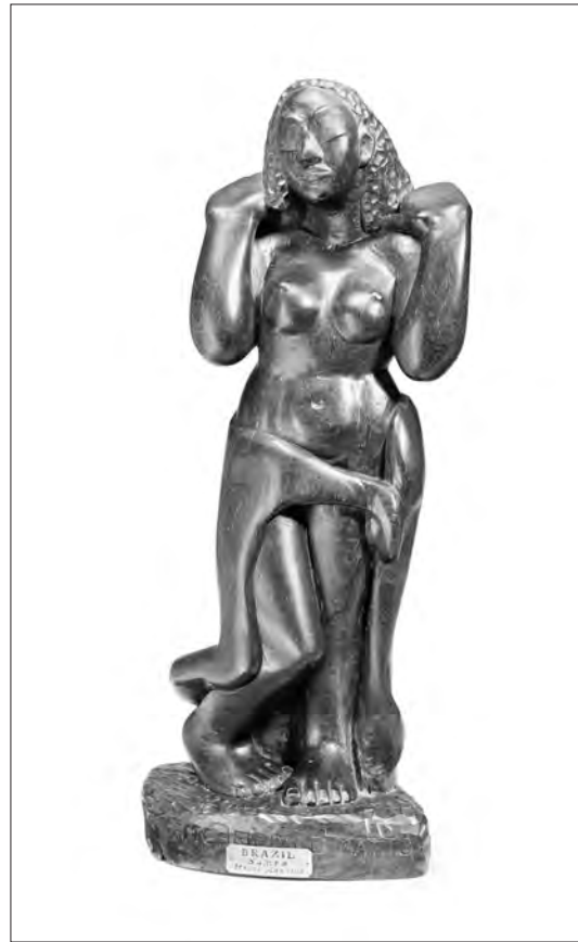
Fig. 3 Maria Martins, Samba , Jacaranda, unknown date, I.B.M. Collection ( Art News , January 15-31, 1942, 19).

Maria’s sculpture and its reception by the surrealists created a dialogue on freedom from many different perspectives: political liberation from colonialism, freedom to experiment with new sculptural form, rebirth and transformation in the face of the horrors