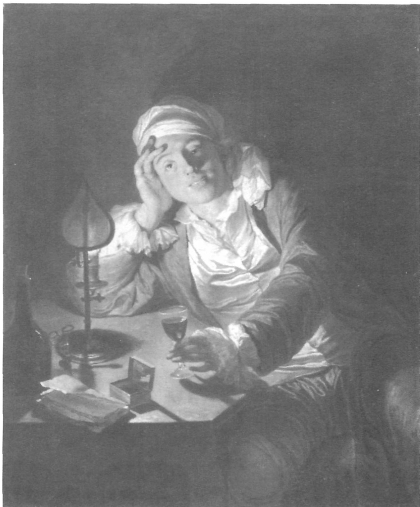
Figure 4. Anna Dorothea Therbusch, Un homme, le verre à la main, éclairé d'une bougie (Le Buveur). Paris, École nationale supérieure des beaux-arts.