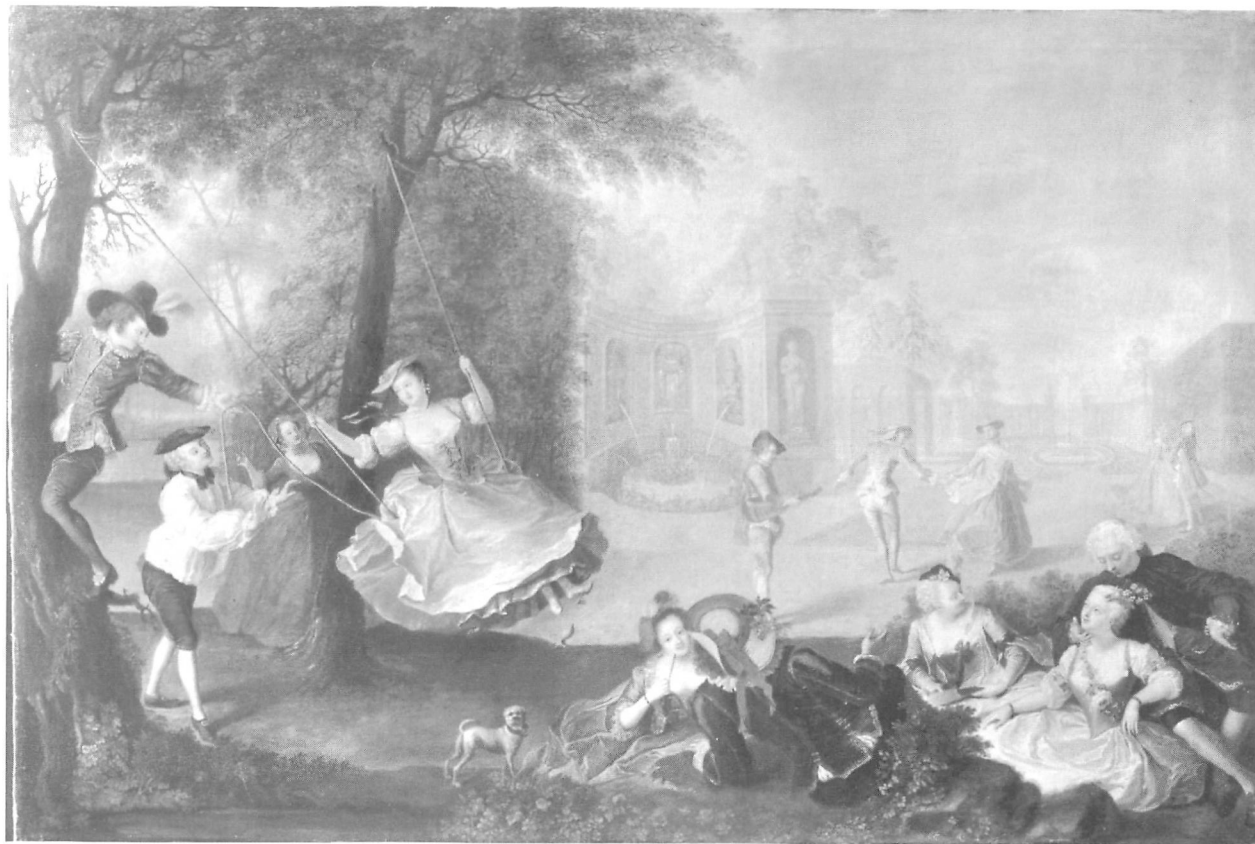
Figure 2. Anna Dorothea Therbusch, The Swing . Potsdam, Neues Palais. Stiftung Preussische Schlösser und Gärten, Berlin-Brandenburg.