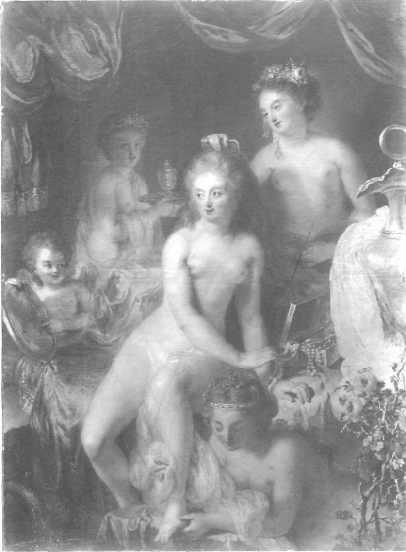
Figure 5. Anna Dorothea Therbusch, The Toilet of Venus. Potsdam, Neues Palais. Stiftung Preussische Schlösser und Gärten, Berlin-Brandenburg.