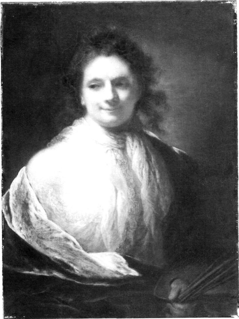
Figure 3. Anna Dorothea Therbusch, Self-Portrait. Stuttgart, Staatsgalerie