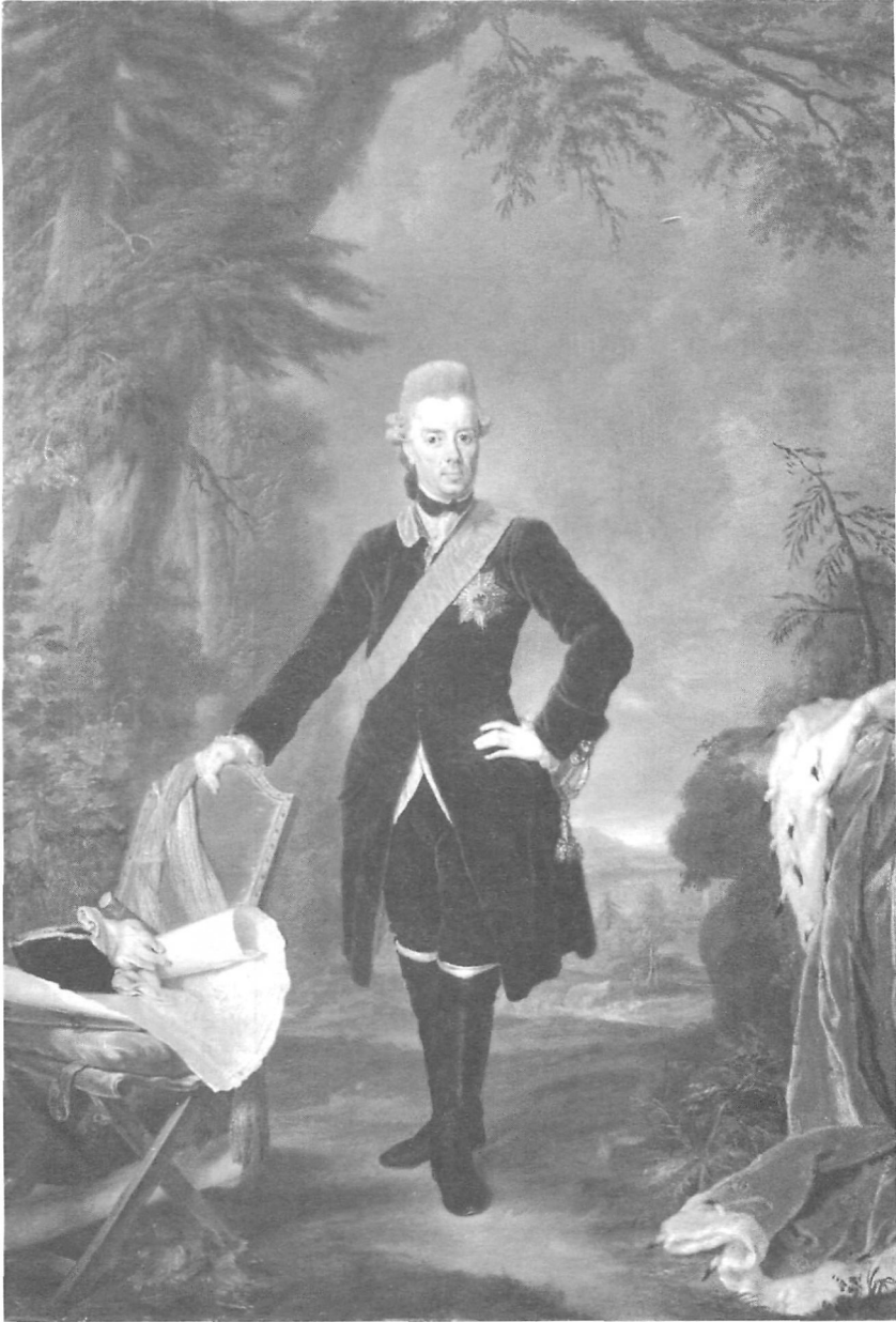
Figure 1. Anna Dorothea Therbusch, Prinz Henrich von Preußen. Potsdam, Neues Palais. Stiftung Preussische Schlösser und Gärten, Berlin-Brandenburg.