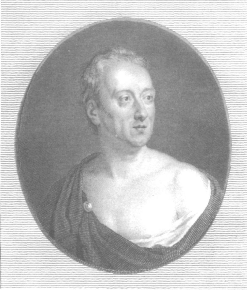
Figure 7. Denis Diderot. Engraving by Pierre Bertonnier after Anna Dorothea Therbusch.