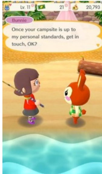
Figure 3 - Friendship is given a materialistic twist in Pocket Camp

This, then, is a basic summary of the gameplay in Pocket Camp : players collect goods to give to animals for money, materials, and friendship points and these resources are converted into furniture which satisfies the player's aesthetic sensibilities while also leading to the chance for more resources. This cycle continues until the player either gets bored or there are no more animals to befriend, although Nintendo is patching the game constantly to add new animals as well as special time-sensitive events that the player can partake in. Playing regularly is also incentivized through small rewards for simply logging in each day, so player retention is clearly a design goal. With the core gameplay explained, we are now ready to move on to the matter of time in the game.