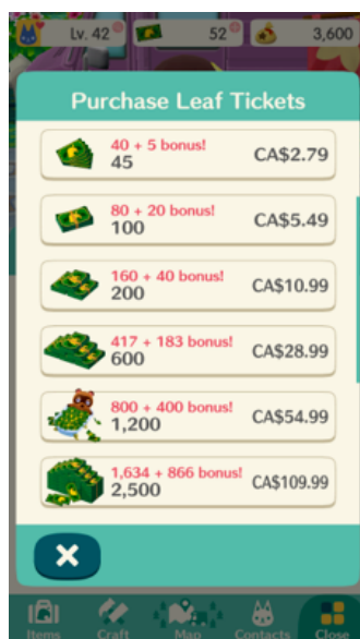
Figure 4 – The going exchange rate for Canadian Dollars to Leaf Tickets

Enter Leaf Tickets, a new currency that is distinct from Bells both in what one buys with it and in how one earns them. Put simply, the primary purpose of Leaf Tickets is to eliminate any of the above wait times. The chief way of acquiring Leaf Tickets is by purchasing them with real money via credit card (see Figure 4 ). If the apple trees simply need to bear fruit this second, you can pay. If you want to skip right to that furniture being built, you can pay. Even if you lack the requisite materials to build a particular object, the crafter can spin Leaf Tickets into wool, wood, and metal. If one is willing to pay, most of the game's repetitive chores (and with them, most of the game's mechanics) become unnecessary.