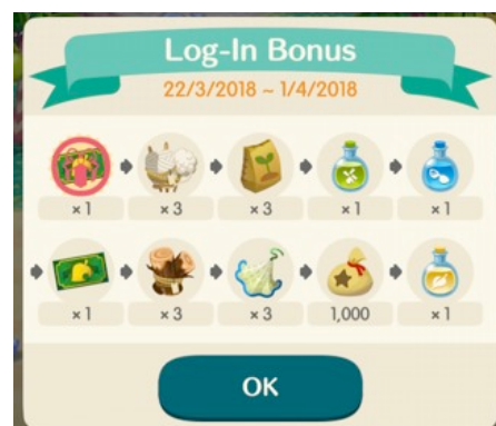
Figure 6 – An example of 10 days’ worth of log-in bonuses. The game is clearly happy to reward players for their engagement, however modestly.

Consider, once again, some key points about Pocket Camp ’s gameplay. If a player is willing to wait for objects to be built, they need not spend Leaf Tickets. This in itself is not a major revelation. But in actual fact, if a player is patient enough, they need not even harvest fruit, catch fish, or befriend animals. With the resources the player is given at the start of the game along with the daily log-in bonuses one receives, a player could access most of the game without ever taking part in the game’s repetitive, labour-like chores (see Figure 6 ). Since Pocket Camp turns natural resources and indeed friendship into currencies, the player can acknowledge this and refuse to receive that ‘waged labour’ in kind, and instead opt to wait for the game to give them enough materials to continue.