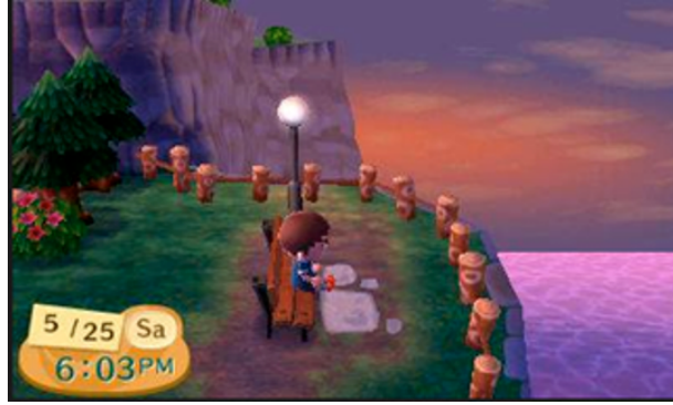
Figure 1 – A moment that, while unassuming, was unlike any other that I had experienced in a videogame

As someone whose research has historically centered on games and speed, I have also been struck by the fact that Animal Crossing is one of the few games that punishes the player for running rather than walking without stealth being a core gameplay mechanic. In most games, one sneaks to avoid detection whereas in Animal Crossing one walks to avoid trampling flowers or scaring off fish and insects that can be caught and either sold or donated to the museum. Whether the player wishes to wear the hat of a capitalist, conservationist, or a landscaper, they would do well to walk from place to place. It is not as though running is ever made necessary either.