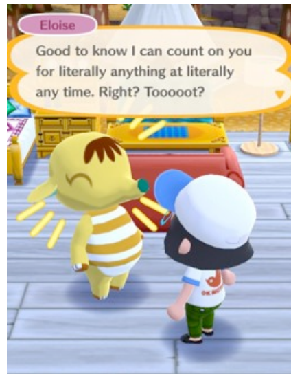
Figure 5 – I cannot help but be reminded of Amazon CEO Jeff Bezos’ infamous push for ‘humans as a service’.

labour-like chores and a steadily-increasing ratio between wait-time and play-time to make the game actively less enjoyable to play unless one spends money. It is interesting that this disrupts even the already-problematic idea that mobile games are meant to be played in the tiny gaps we have between our regularly-scheduled periods of work. A player cannot pick up Pocket Camp where they left off like they might a game of Solitaire . Instead, the game asks that players schedule their lives around it unless one is able to pay for the privilege of escaping those parts of the game that are most labour-like.