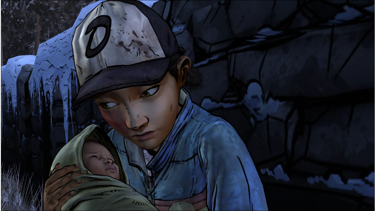
Figure 3: Clem and AJ. Screenshot taken from The Walking Dead: Season Two

giving him another chance at fatherhood. 2 He admits that he failed to raise his late son like he should have and vows not to make the same mistakes raising AJ. However, following Kenny's death later in the episode, Clem becomes AJ's sole parent.