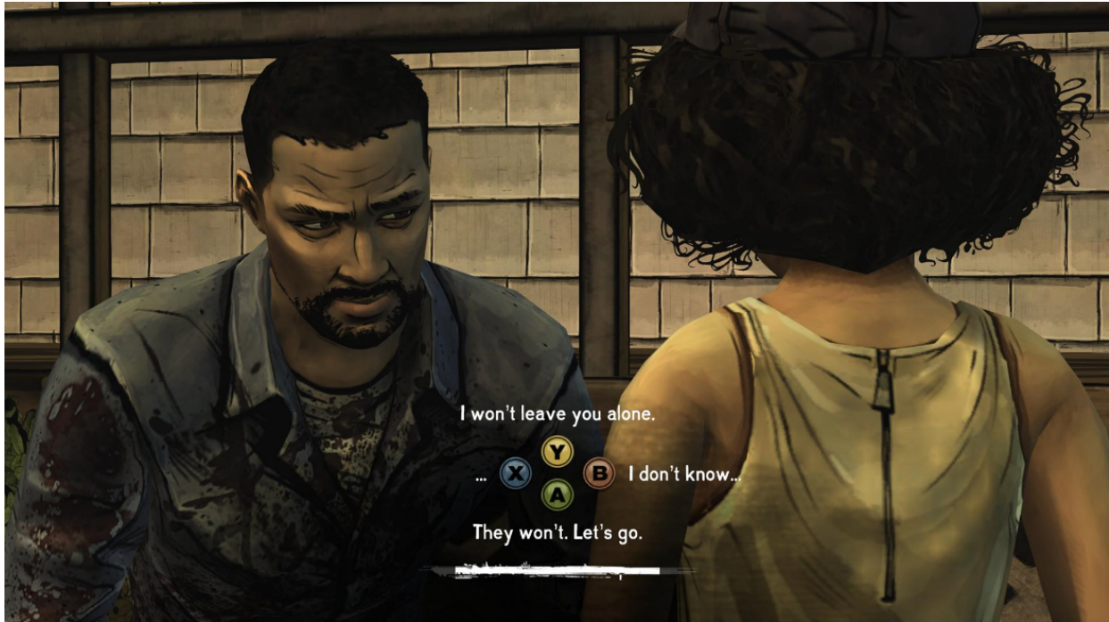
Figure 1: Lee and Clem. Screenshot taken from The Walking Dead: Season One