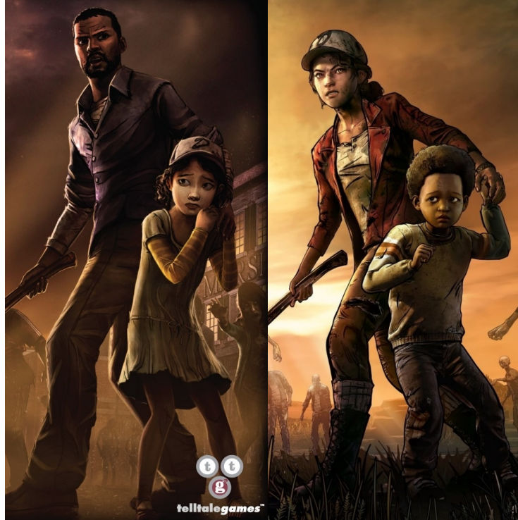
Figure 7: Screenshots of the cover art from The Walking Dead: Season One and The Walking Dead: The Final Season