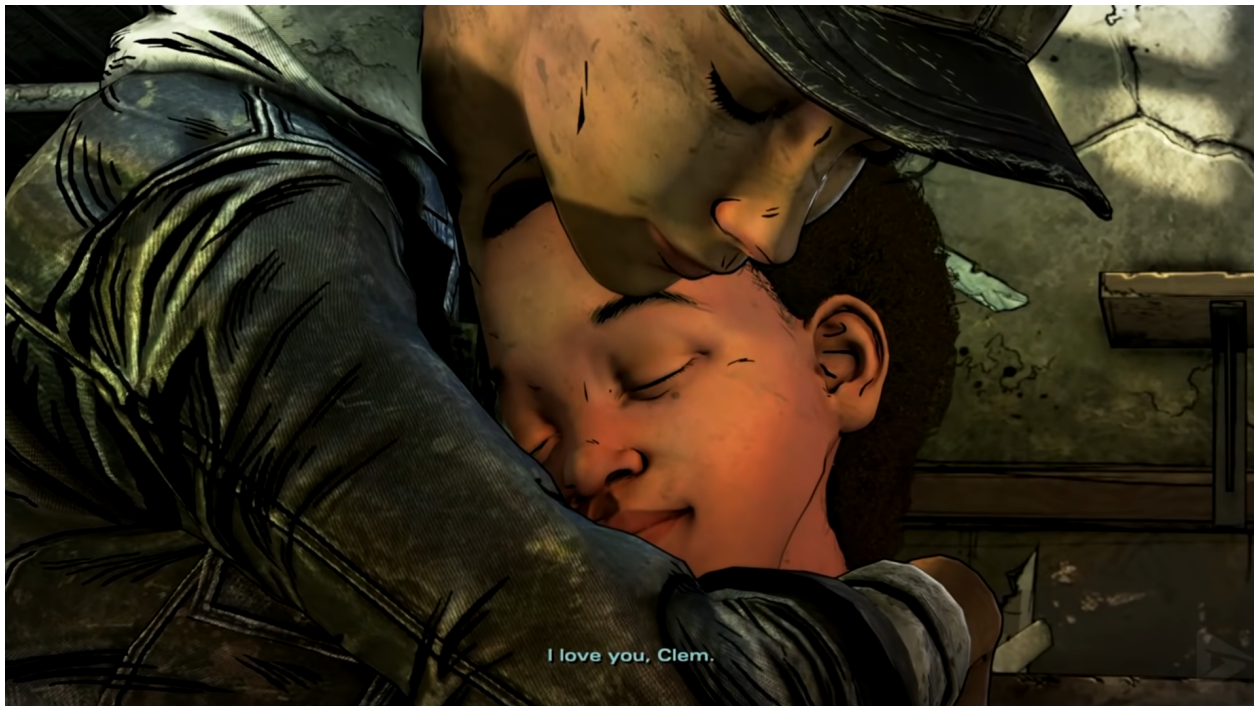
Figure 6. Clem and AJ share a tender moment. Screenshot taken from The Walking Dead: The Final Season

Importantly, although there is a lot of violent action in the final season, there are also several moments of teaching, caretaking, and tenderness between Clem and AJ. For example, AJ asks Clem how to get rid of his trauma, admits how terrified he is of losing her, and they say “I love you” to each other and hug (see Figure 6 ). These moments echo the interactions between Lee and Clem in S1 and send the message that Clem is a good mother, just as Lee was a good father.