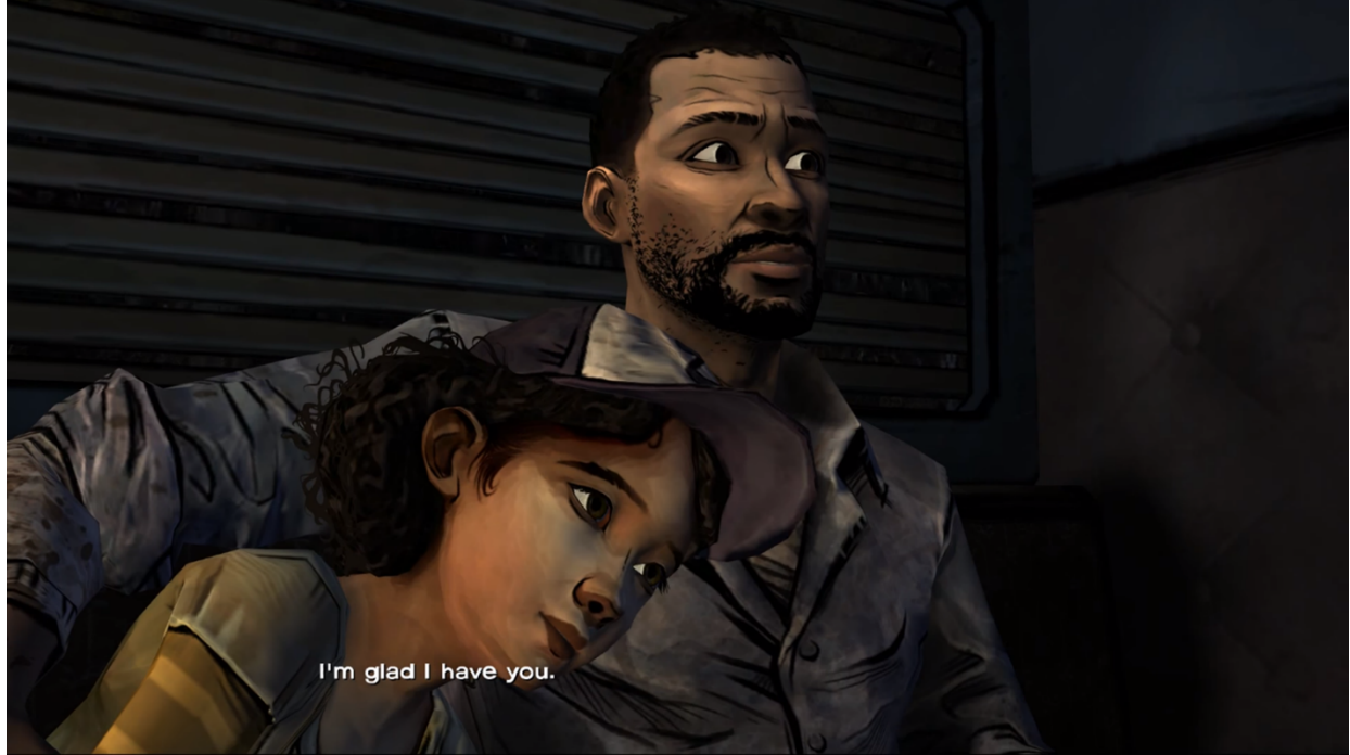
Figure 2: Lee and Clem. Screenshot taken from The Walking Dead: Season One