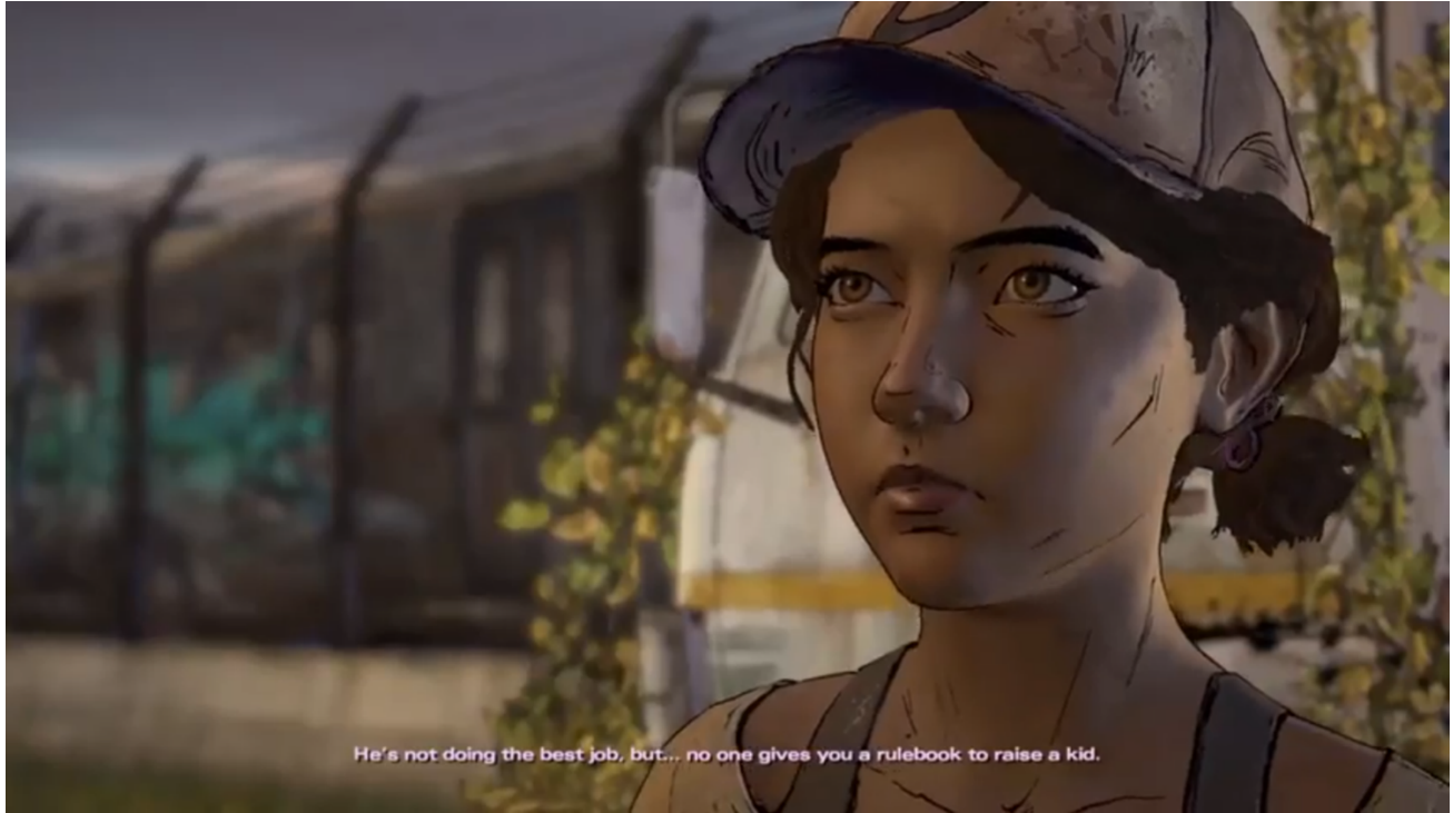
Figure 4: Clem. Screenshot taken from The Walking Dead: A New Frontier

Another example occurs in a conversation between Clem and Javi: although Javi is not a father-figure for Clem, he is tasked with explaining menstruation to her in one memorable scene. Clem knows that it is normal, but no one ever explained to her what it means, so the player can choose for Javi to tell her that her body is changing and that it means she could become a mom if she wanted. This moment of care is reminiscent of the way Lee interacted with Clem when he cut her hair – slightly awkward due to stereotypical masculine discomfort with feminine topics but enacted with kindness and honesty. However, the most notable element in this scene is Clem’s reaction to Javi’s explanation: “Funny. I already felt like a mom. Kenny used to say I was a natural-born mother” (S3; see Figure 5 ). This statement is followed by a flashback in which players see Clem, Kenny, and AJ around a campfire. Kenny tells Clem that she’s the only “mama” that AJ has, and that she is “protective, loving, caring... All the things a good parent needs to be and all at your age” (S3). Clem already felt like a mother, regardless of her reproductive biological functions and age, and she believed, and was told, that she was good at it.