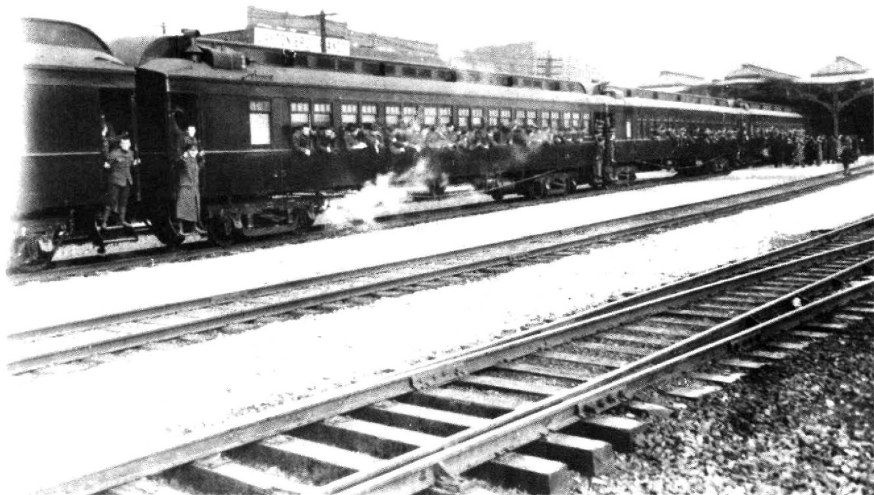
Canadian Troops leaving Windsor Station, Montreal.