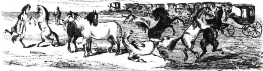
6. A RECEIPT FOR THREE.

The Cabman's Strike, Canadian Illustrated News, volume 3, 13 May 1871, p.300.