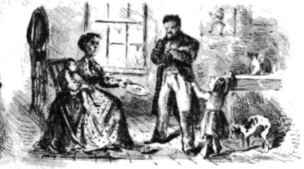
5. THE POOR CABMAN'S HOME.