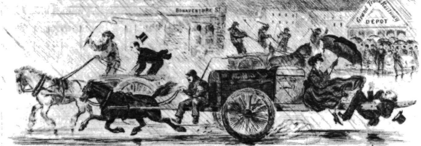
1. ON THE ARRIVAL OF TRAINS.