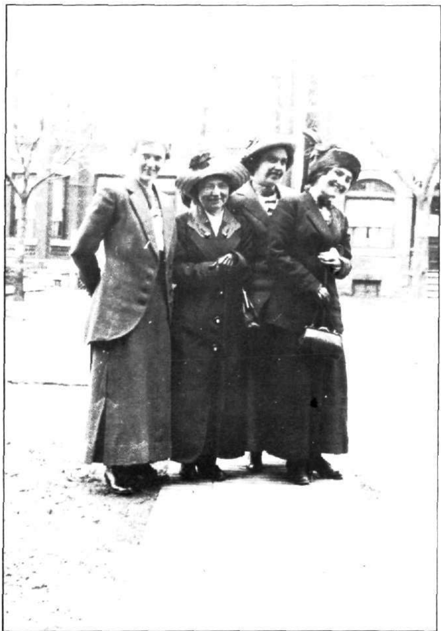
Four Toronto teachers, in a relaxed moment, in front of Church Street School, c. 1915. By this date, rising hemlines may have been a happy answer to the problem of keeping skirts clean in schools with dirty or oily floors.