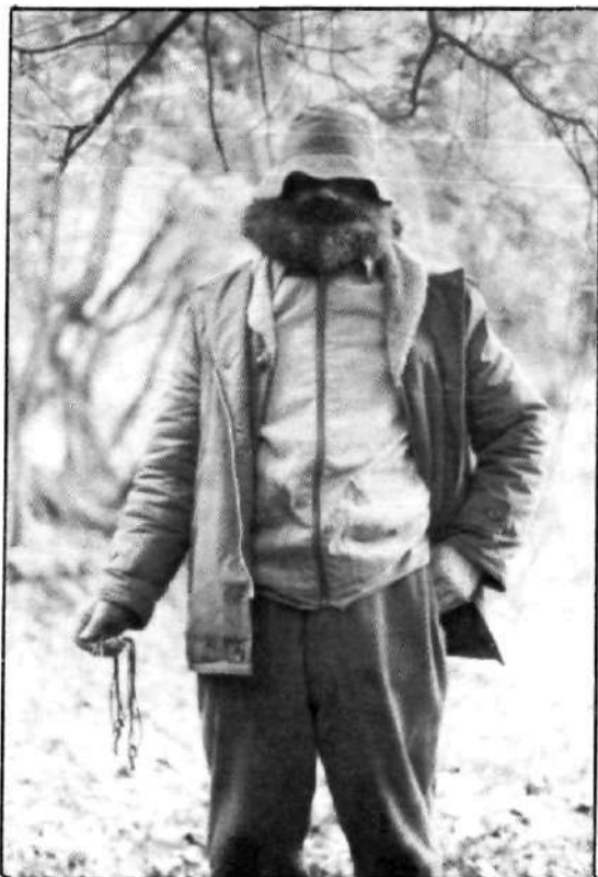
An Unexpropriated Romany Man Holding Rabbit Snares, Worcestershire, Winter 1979

This comes from a somewhat later period but in showing us some of what the Romany knew in order to survive, it can show what others might learn from them. 18