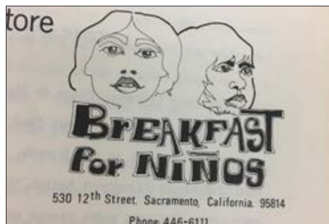
Figure 6: Breakfast for Niños logo, 1970s. One of RCAF’s most significant community programs was Breakfast for Niños, which was modeled on the Black Panther Party’s Free Breakfast program in the nearby African American community of Oak Park. Established by RCAF members Irma Lerma Berbosa and Lorraine García-Nakata, Breakfast for Niños became the fiscal and organizational umbrella under which much of RCAF’s programming and funding was made possible.