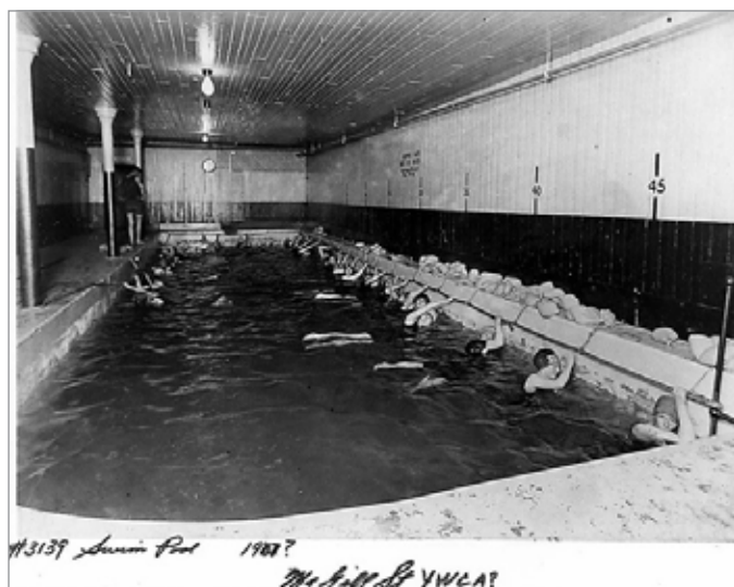
FIG. 4. WOMEN'S SWIMMING LESSONS, POSSIBLY AT THE MCGILL STREET YWCA IN TORONTO, C. 1907.