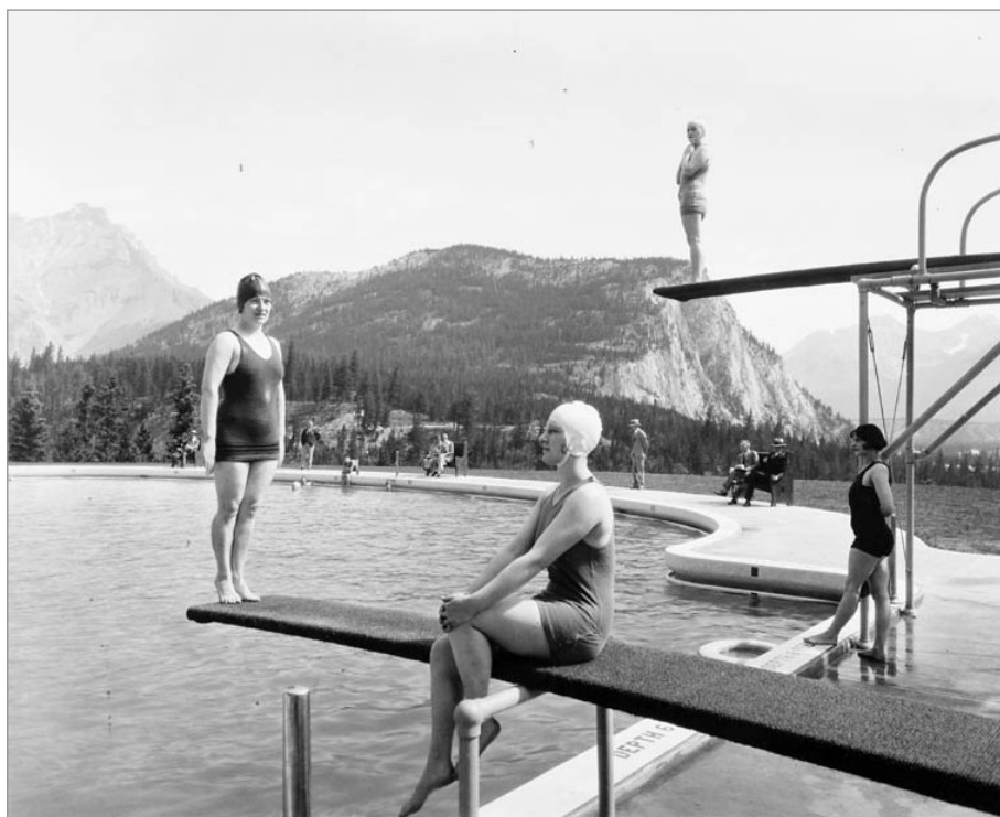
FIG. 14. SWIMMING POOL AT THE REMOTE BANFF SPRINGS HOTEL, C. 1930S. BUILT AMONG THE SPECTACULAR ROCKY MOUNTAINS, THIS WAS POSSIBLY THE FIRST GRAND HOTEL POOL IN CANADA.

As Wiltse reports of pools in the early twentieth century, "Swimming pools, for the most part, resisted commercialization. Entrepreneurs opened some for-profit pools during the interwar years, but they struggled to compete against the ubiquitous publicly owned pool, and many went out of business." 58 This struggle may be reflected in the decision of the Canadian railway companies to add pools to only three more of their dozens of hotels. These were the Digby Pines Hotel in Nova Scotia, Château Montebello in Quebec, and the Château Laurier, all added in the years 1929 and 1930. 59 Prior to this, only the two great Banff hotels (Banff Springs and Château Lake Louise) had undertaken such an improvement, and, perhaps tellingly, no other pool would be installed in any of the Canadian Grand Hotels until 1972. Indeed, most of the world's