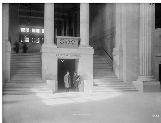
FIG. 2. THE TUNNEL ENTRANCE FROM GRAND TRUNK CENTRAL STATION TO CHÂTEAU LAURIER, 1916.