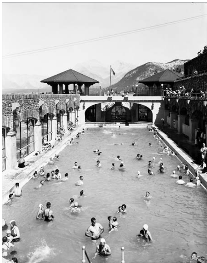
FIG. 10. THE BATHING PAVILION AT BANFF SPRINGS, BUILT 1914, PHOTO TAKEN 1941, FEATURING A THREE-TIERED SPECTATORS' BALCONY.