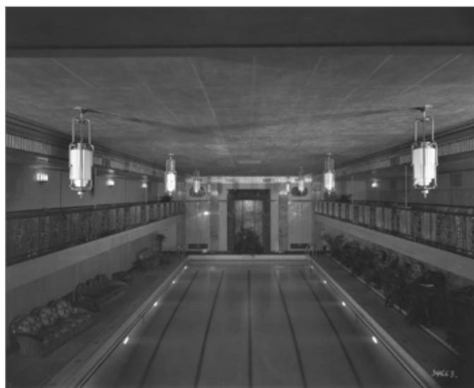
FIG. 7. CHÂTEAU LAURIER'S SWIMMING POOL, 1931. | CANADIAN NATIONAL RAILWAY COMPANY, LIBRARY AND ARCHIVES CANADA, PA-175313.

and modern design. 29 Under the traditional châteauesque exterior of Archibald and Schofield's new wing could be found an eclectic array of historic and modern architectural styles. As well as a formal Adam style dining room, the hotel opened the Jasper Tea Room—a restaurant decorated in stylized Canadian and aboriginal themes which “quickly became the favourite meeting place for Ottawa's young people.” 30 Château Laurier was shifting from the era of formal Louis XVI drawing rooms to the young and fashionable roaring twenties. Indeed, with the opening of the new addition, the hotel would see the signatures of film stars like Marlene Dietrich, Nelson Eddy, and Bette Davis added to its register. 31