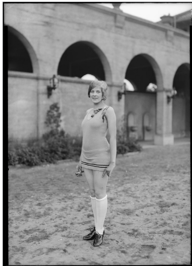
FIG. 11. BEAUTY CONTEST WINNER, 1926, WEARING A CONTEMPORARY SWIMMING SUIT.