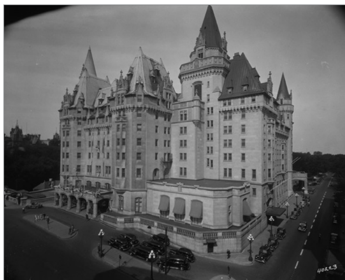
FIG. 6. THE 1929 ADDITION TO CHÂTEAU LAURIER, PHOTO TAKEN 1937.