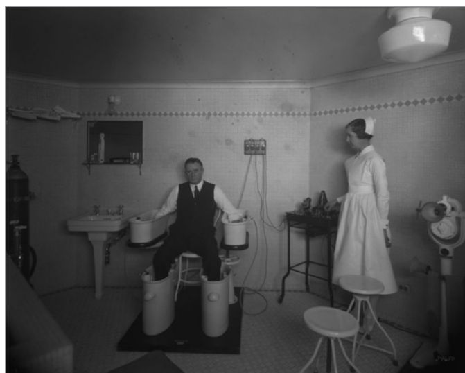
FIG. 9. CHÂTEAU LAURIER THERAPEUTIC DEPARTMENT'S SCHNEE BATH TREATMENT, 1931.

end of the pool, a two-storey alcove held a decorative fountain, its lintel carved with waves. The fountain and alcove were executed in the same dark green marble as the pilasters, and were flanked on either side by ornate brass grates depicting stylized fish and shells. The second storey of the room featured a long, nearly wrap-around gallery decorated with an intricate, hand-wrought brass railing, and the tiled ceiling above was surrounded by a fluted white frieze adorned with carved marble panels. Other luxurious fittings included the original, brass, Art Deco lanterns, and the so-called "Angel's Stairway," a golden spiral staircase that connected the ladies changing rooms to the pool area. 39