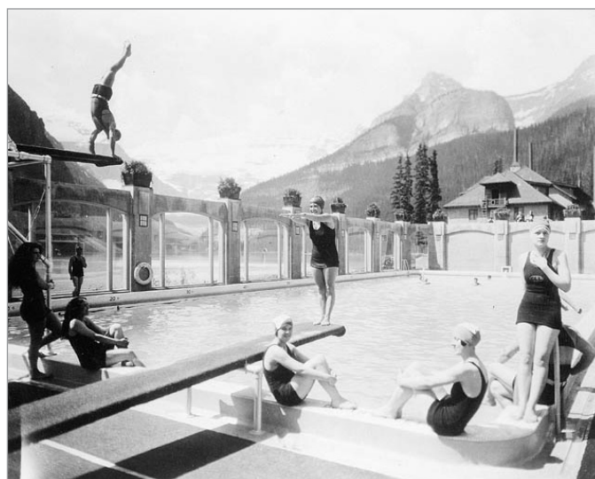
FIG. 5. CHÂTEAU LAKE LOUISE'S SWIMMING POOL, THE SECOND LARGEST POOL IN CANADA AT TIME OF CONSTRUCTION. INSTALLED IN 1926, PHOTO C. 1930.

public cleanliness and rowdy conduct remained primary concerns. The second was associated with “swimming” facilities and health clubs, which were made available to the middle classes in the form of paid-admission pools like those at the YMCA. The latter sought to emulate the attitudes of the upper classes, who were, in turn, beginning to adopt the idea of pools as leisure spaces, with private pools being installed in the homes of the wealthy as early as 1895. 23