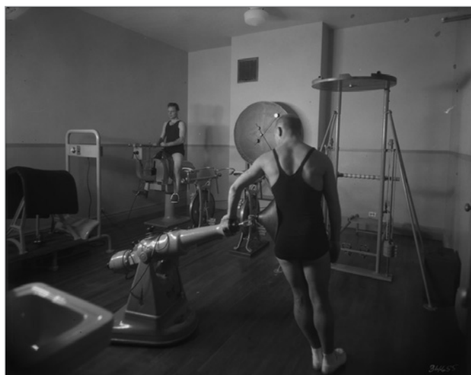
FIG. 8. THE GYMNASIUM IN CHÂTEAU LAURIER'S THERAPEUTIC DEPARTMENT, WITH PATIENTS USING THE ELECTRIC HORSE AND THE VIBRATIONS MACHINE, 1931.