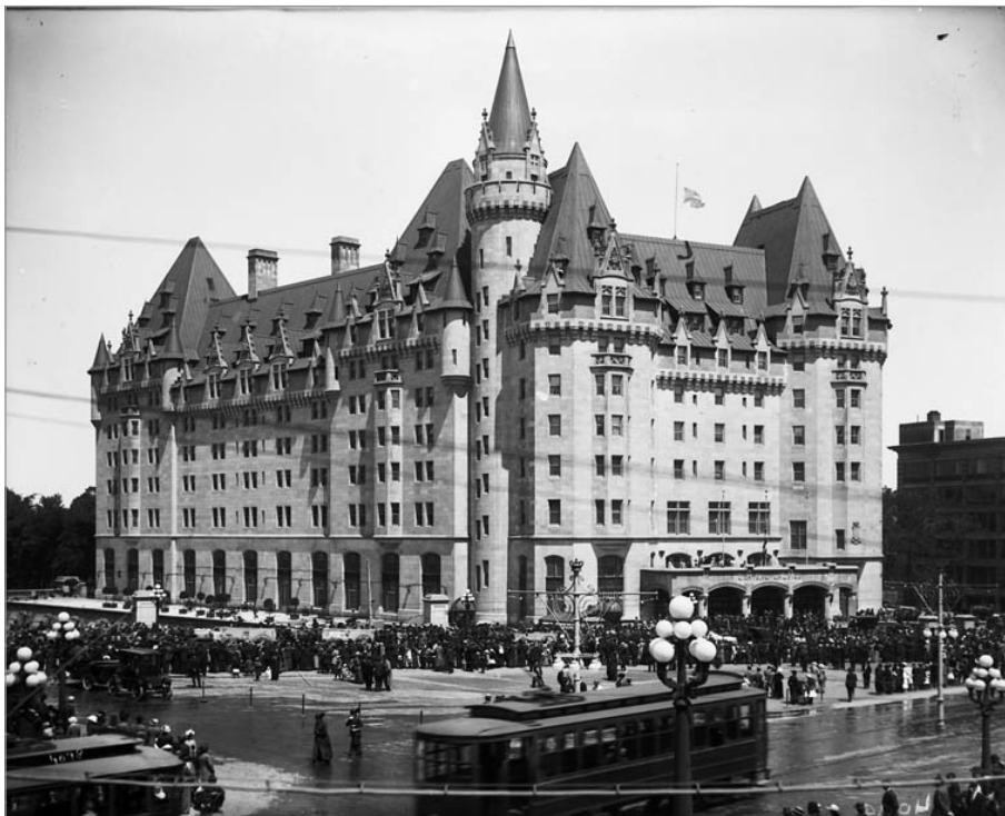
FIG. 1. CHÂTEAU LAURIER, OPENING DAY, JUNE 1, 1912.

While swimming pools have seen more scholarly attention in recent years, the role and influence of swimming culture in luxury hotels has not. 3 Hotel pools in particular, being non-essential leisure amenities, are understudied, yet their ubiquity, popularity, and stylistic and functional diversity make them worthy of our attention. They have much to tell us about changing historical perspectives on health, leisure, popular culture,