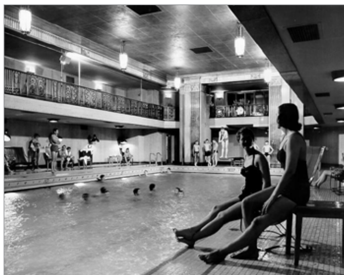
FIG. 13. CHÂTEAU LAURIER SWIMMING POOL, C. 1940. NOTE THE LOUNGE WINDOWS OVERLOOKING THE DIVING BOARD.

to a pair of swimming trunks, and the “Kellerman style” was gradually abbreviated to a skirtless, one- or two-piece outfit (fig. 11). 48 These revealing fashions inevitably heightened the sexual climate at swimming pools. 49 As bodies became publicly visible, the importance of physical appearance increased accordingly, and so a day at the pool became an exciting experience for voyeurs and exhibitionists alike.