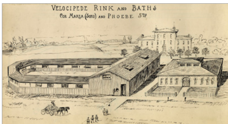
FIG. 3. THE VELOCIPED RINK AND BATHS IN OLD TORONTO (BATHS SEEN ON THE LEFT). ONE OF CANADA'S EARLY SWIMMING BATHS (C. 1860), IT SEEMS TO HAVE BEEN FED BY NEARBY LAKE ONTARIO.

nineteenth century, and were sometimes accompanied by a structure containing changing rooms or other facilities. The new swimming baths—sometimes called “plunge baths” or “river baths” depending on their depth or location—were quickly perceived more as places of entertainment than hygiene however. Splashing and roughhousing quickly became commonplace, especially among young men and boys. 16 The popularity of the new facilities was demonstrated at one pool in Philadelphia in 1884, when, in their enthusiasm, eager young bathers “tore the door from its hinges and knocked down the fence that surrounded the pool.” 17 As this popularity increased and caused swimming baths to become more widespread, in-ground facilities gradually became the norm, and standards of appropriate behaviour at public baths became a much-debated matter of public concern. 18