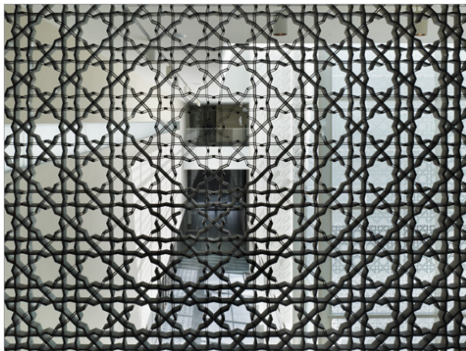
FIG. 4. VIEW THROUGH ONE OF THE INTERIOR WINDOWS OVERLOOKING THE CORRIDORS SURROUNDING THE COURTYARD, CLAD WITH PATTERNED METAL SCREENS.

interpretation is the notion that the AKM, along with its grounds (labelled an “oasis” by one reviewer), are places for contemplation; adjectives such as quiet, tranquil, and serene are used to describe what a visitor might expect from an encounter with the building. 45