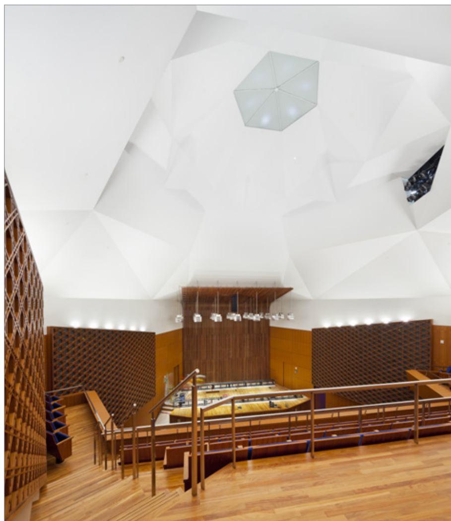
FIG. 6. VIEW OF THE AUDITORIUM WITH ITS DOMED, FACETED CEILING, AND TEAK-LINED SURFACES, PHOTOGRAPHED FROM THE BALCONY.

What is surprising here is the fact that the architect hails from a culture that has experienced its fair share of fetishization, so one would expect more sensitivity to how other non-Western cultures are represented. Furthermore, Maki was trained by a generation of modern Japanese architects who became renowned for absorbing lessons from vernacular Japanese architecture, reinterpreting and transforming it radically to convey certain spatial moods, light qualities, or material sensibilities in modern and abstract ways (but perhaps it is one thing to be immersed in and re-channel one's own culture, and another to translate someone else's, especially a culture that has been Orientalized for centuries). 75 Even the features of the AKM building