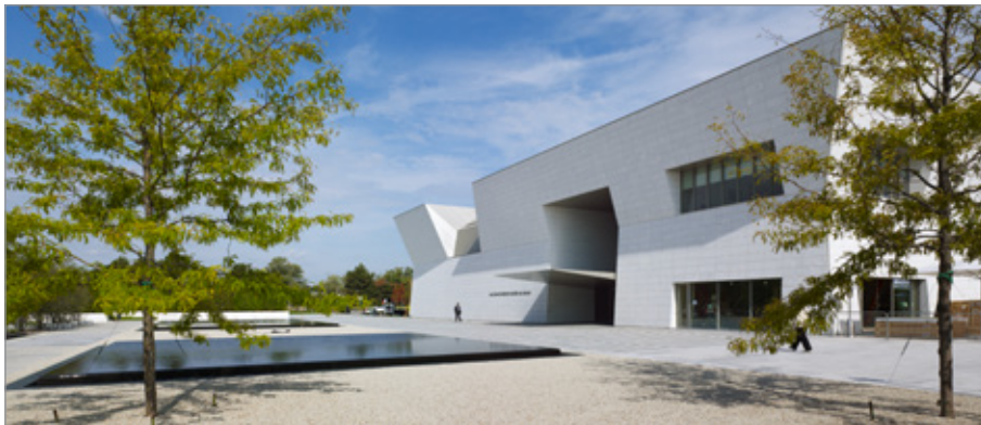
FIG. 1. VIEW OF THE SOUTH CORNER OF THE AGA KHAN MUSEUM (AKM), DESIGNED BY FUMIHIKO MAKI, WITH ITS PUBLIC ENTRANCE MARKED WITH A THIN METALLIC CANOPY, FACING THE PLAZA LINKING IT TO THE ISMAILI CENTRE DESIGNED BY CHARLES CORREA (NOT VISIBLE IN THIS IMAGE).

The significance of this building cannot be overstated. It houses North America's first purposely built museum dedicated to displaying the arts of the Muslim world. 3 The fact that the building has been erected where Muslims are not in the majority means the institution bears great responsibility: representing the diverse cultures associated with Islam, and informing those who are unfamiliar with complexity of this faith. The building houses a permanent collection, the core of which covers ten centuries of history and vast geographies (from China to Spain), and includes manuscripts; decorative objects in ceramic, metal, glass, and other materials; arms and armor; jewelry;