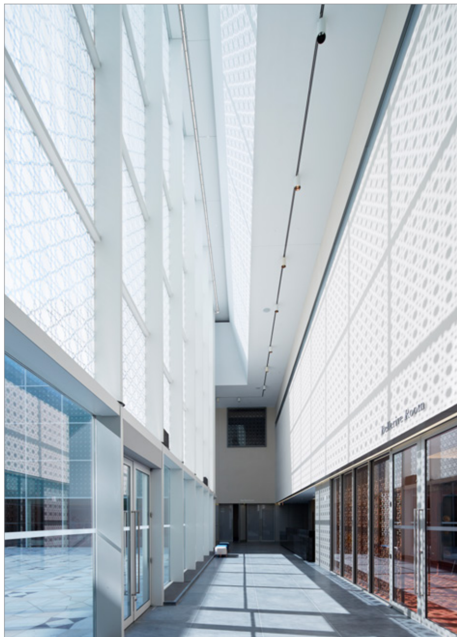
FIG. 3. VIEW OF A CORRIDOR ADJACENT TO THE COURTYARD, SHOWING PATTERNS CAST BY NATURAL LIGHT ON THE WHITE WALL SURFACES, AS WELL AS THE PATTERNS ON THE GLAZED SURFACES OF THE COURTYARD. | COURTESY OF THE AGA KHAN MUSEUM, PHOTOGRAPHER JANET KIMBER.

But there is a lot more taking place within the design than the mere use of patterns. The allusion to historical precedents permeates the building, and has impacted the ways in which the spaces are laid out and various architectural elements are deployed. Apparently, Maki had a say in designing the entire site: an "Islamic" formal garden was to serve as a centrepiece of a master plan that organizes the site, inspired by the Timurid-era Registan Square in Samarkand (modern day Uzbekistan), thus establishing a specific relationship between the AKM and the Ismaili Centre buildings—even though the scale of the referenced urban constellation was quite different. 32 (Curiously, it has been reported that the