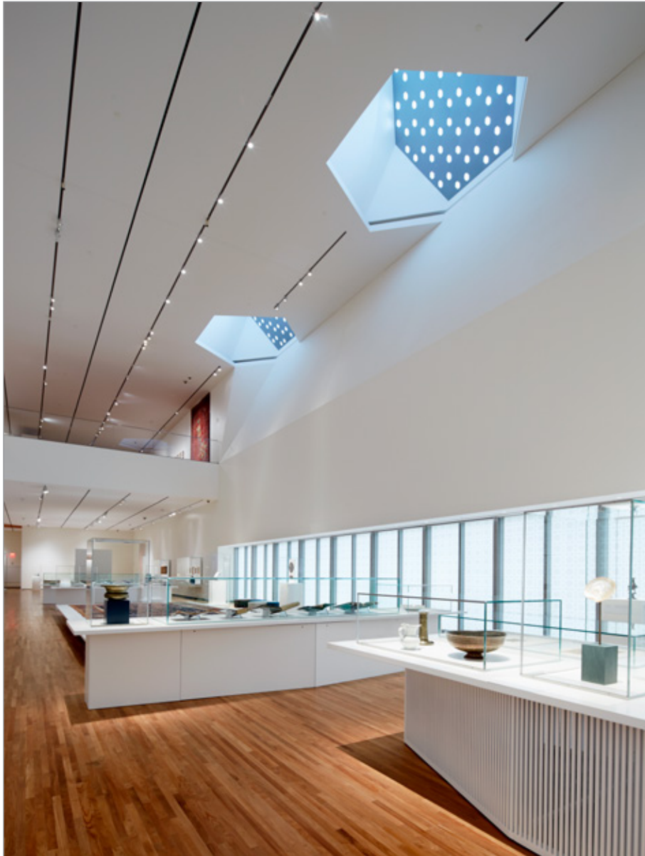
FIG. 5. VIEW OF THE GROUND LEVEL PERMANENT EXHIBITIONS SPACE, WITH THE HEXAGONAL APERTURES THAT BRING INDIRECT LIGHT SEEN ABOVE.

on so many levels. Programmatically, there might be a relation, in that even though the spaces are used for different purposes, they are both spaces for congregating. But here the original faceted ceiling, refined and delicate in scale, has been exaggerated for the sake of creating a geometry a lot more striking visually. The form