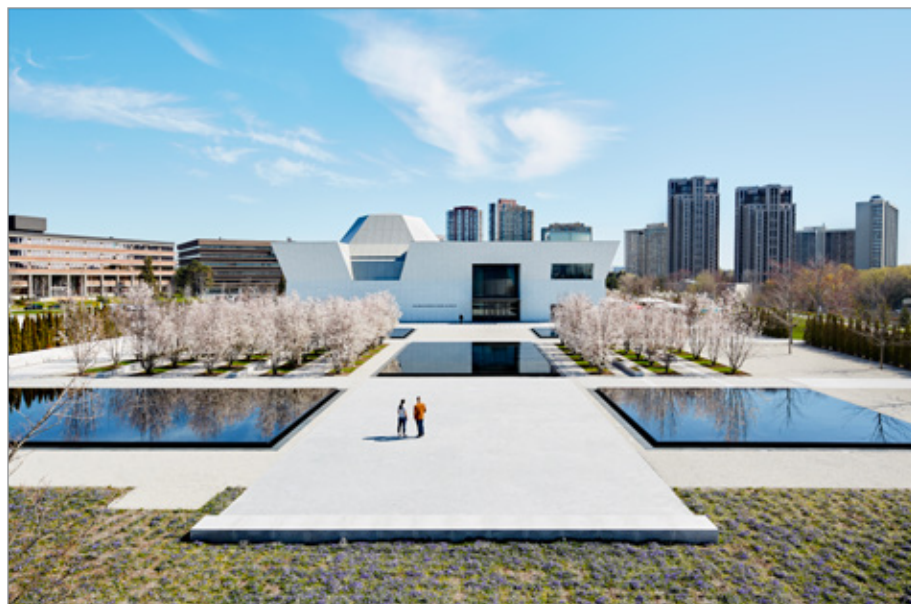
FIG. 7. VIEW OF THE AKM IN CONTEXT, PHOTOGRAPHED FROM THE ISMAILI CENTRE, WITH THE PLAZA SHARED BY THE TWO BUILDINGS SEEN IN THE FOREGROUND.

spirituality (rather than sophisticated philosophical, social, or political concepts reserved for Western architecture). 83