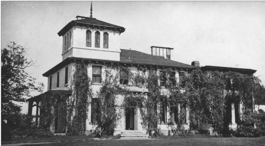
FIG. 3. BARTON LODGE [188?].