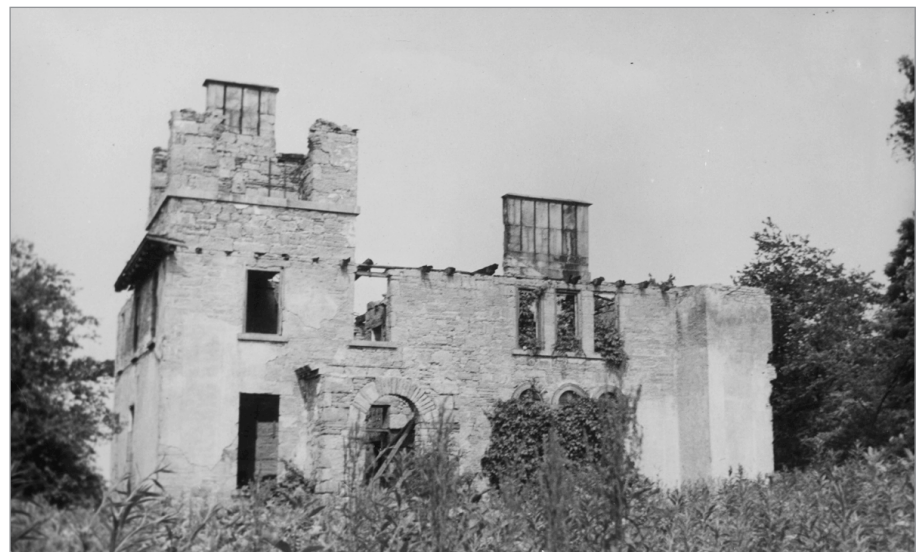
FIG. 9. BARTON LODGE REMAINS, 1942.

fashionable in mid-century designs (fig. 9). For shade, second storey windows were positioned high, close under the eaves, another feature of the Italian style, according to Loudon. 102 Bardwell anticipated the villa would need additional shade and showed an awning over the ground floor window by the entrance. Barton Lodge lacked an awning there, but appears to have had awnings on the second floor windows of the same sort as illustrated in Loudon's book.