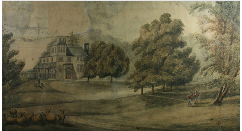
FIG. 2. [ROBERT C. WETHERELL], BARTON LODGE [1835].

In Wetherell, Whyte found such a man of taste, and in Bardwell, he found a reference. Bardwell, described by architectural historian Christopher Webster as “a minor