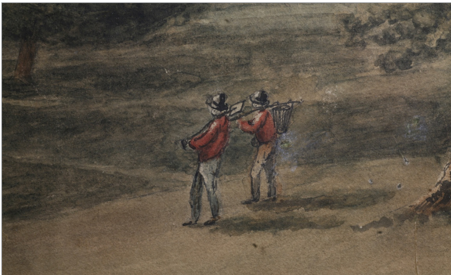
FIG. 4. [ROBERT C. WETHERELL], LABOURERS, DETAIL FROM BARTON LODGE [1835].

not match the detail of the ground floor rounded windows, which were built as represented in the painting. The verandah roof as built had a hipped side unlike the square side in the painting. The chimneys are more ornamental in the painting. So many differences between the watercolour and the photograph suggest some purpose, rather than an inexperienced representation of a built structure. That the painting was by the architect's hand, showing options, seems plausible.