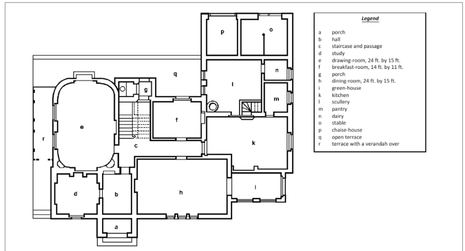
FIG. 8. WILLIAM BARDWELL, FLOOR PLAN FOR A SMALL VILLA, OR PARSONAGE, IN THE ITALIAN STYLE. | LOUDON, J.C., 1846 [1833], AN ENCYCLOPAEDIA OF COTTAGE, FARM, AND VILLA ARCHITECTURE AND FURNITURE... , P. 854.

The projecting roof provided shade for the upper storey. As revealed in a photograph of the Lodge in ruins, cantilevered ceiling joists with simply detailed exposed ends supported the roof rafters and offered an unadorned bracketing, 101 which was more obviously a structural part of the roof than the decorative cornices that became