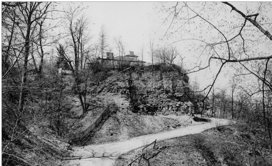
FIG. 7. BARTON LODGE VIEWED FROM BECKETT DRIVE, C. 1899.

the edge that little room was left for a drive. Wetherell therefore reversed Bardwell's siting so that the Lodge faced away from the town and fronted instead onto a park, while the back and side overlooked Hamilton and Lake Ontario. A photograph from 1899 shows just how close the rear open terrace was to the edge of the escarpment (fig. 7).